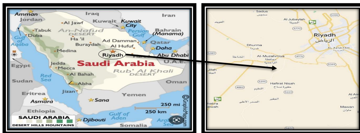
Figure 1: Map of Saudi Arabia showing the study area.

southwest of the city of Riyadh, and about 30 km southeast of Al-Muzahimiyah Governorate (Figure 1).