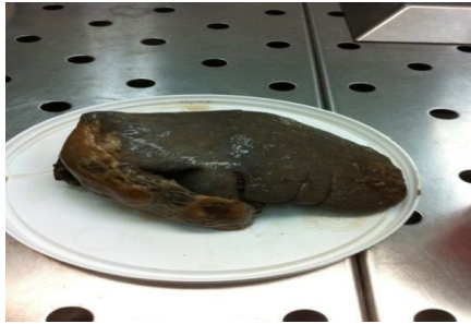
Fig : 1