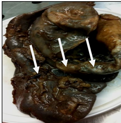
Fig : 3