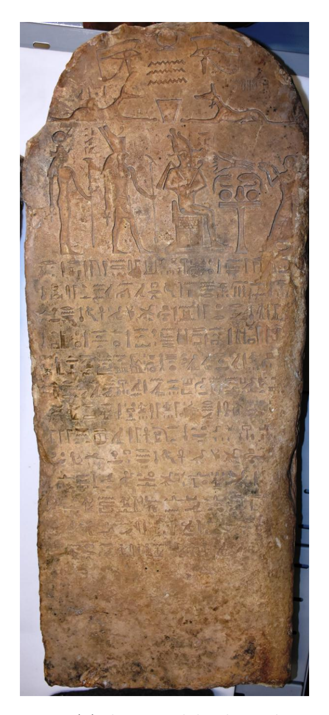
Figure (1)