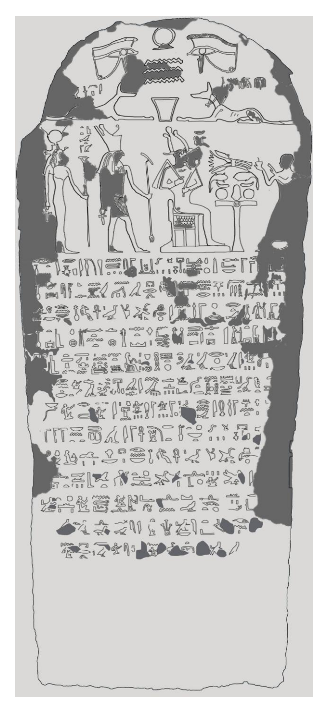
Figure (2) Illustrated drawing of Cairo Stela Sr. 26942