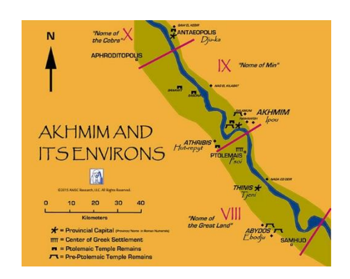
Fig.(1) The location of Akhmim in ancient EgyptFig

The first excavation at Akhmim was undertaken by Maspero from 1884 until the early 1890s in the el Hwawish "ridge cemetery "area (Elias, 2013). Masoero (1893:215) described the excavation "15 days and we uncovered 20 tombs drawing from them 800 mummies". The "ridge cemetery "mummies primarily date to the late 20<sup>th</sup> Dynasty ,as well as ,Third intermediate period ;Late period and Greco-Roman periods.(Maspero 1893,Elis and Lupton 2005,Elies 2013) .