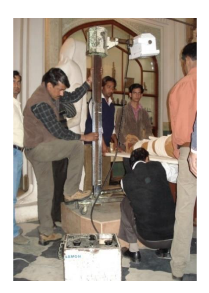
Fig(8) The Egyptian mummy was filmed by potable X-ray.