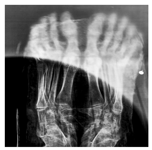
The image is hazy however

can't identify any fracture lines also the joint spaces are preserved. Report of X-Ray written by:-