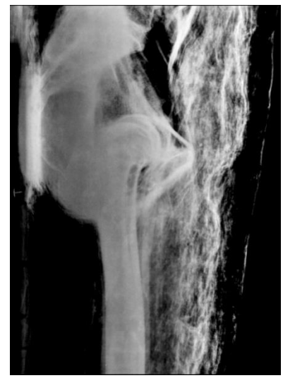
Fig.13(upper A&B) – (Lower C;D&E)F F:FFFFf

*Head femur (Age is mostly range around 45-50 years).