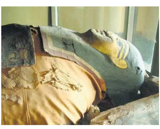
Fig (7) the last layer of textile

3-The mummy was covered by a large piece of textile, by examining it, we recognized that it was not original, it's modern textile and perhaps it used from the time of sending it from Egypt to Jaipur .The original textile found as small pieces pot above this layer.