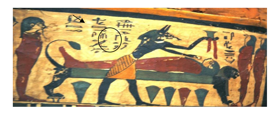
Fig.(14) the name Tutu with determinative man.