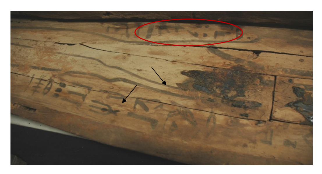
Fig.(6)The base of the coffin

2-The Mummy : In identification card of the mummy written, it was discovered in an ancient city called (Panopolis) during the late period or "Ptolemaic Period", which was known after that under the name of "Akhmim" in Upper Egypt. The mummy of a lady called "Tutu". She was one of the members of priest's family of God "Min" the local God of this city.