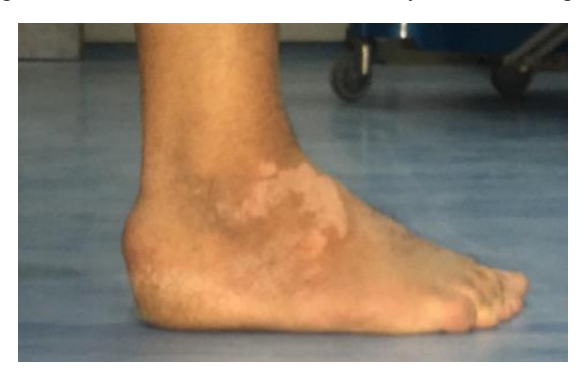
Fig. (1): Haglund deformity.

Inspection for scars of previous operations in the calcaneus and Achilles tendon. Haglund deformity maybe seen in the posterolateral aspect of calcaneus (fig.1). Assessment of hindfoot deformity (varus or valgus) (fig.2).