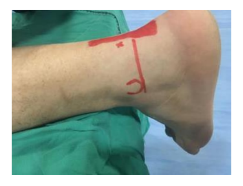
Fig. (11) Posterolateral portal.

Vertical stab incision about 0.5 cm was done, the subcutaneous layer was splitted by a straight mosquito clamp. This incision was just lateral to the Achilles tendon to avoid injury of the sural nerve. The retrocalcaneal space was entered with a blunt trocar (fig.12). A 4.0 mm arthroscope was then placed into the retrocalcaneal space.