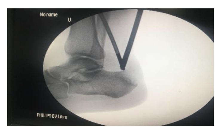
Fig. (16) Intraoperative xray by c-arm while removing haglund deformity.

The hooded portions of the instruments were kept toward the tendon to protect the tendon. Bone resection was done systematically usually from a posterior to anterior direction. The resection was carried out both medially and laterally into the sulcus of the calcaneus and down to the attachment of the Achilles tendon. Adequate exposure and resection of the osseous prominence were generally possible with visible and tactile guidance. C-arm was used to determine and document the extent of the resection fluoroscopically (fig.16).