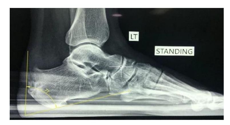
Fig. (5) Left standing x-ray of ankle showing posterior calcaneal angle (fowler and Philip angle).

It was done as routine pre-operative investigation for all patients in our study for assessment enlarged posterosuperior part of calcaneus as in haglund deformity using posterior calcaneal angle(fowler and philip angle)(fig.5) and parallel pitch lines(fig.6) and retrocalcaneal exostosis (fig.7).