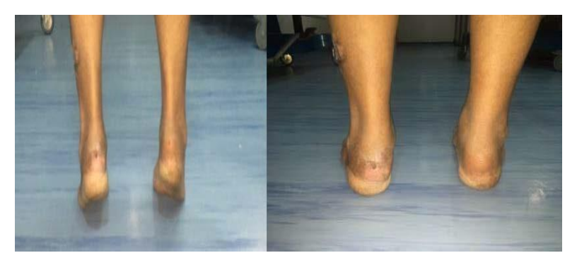
Fig. (2): Assessment of hindfoot deformity.