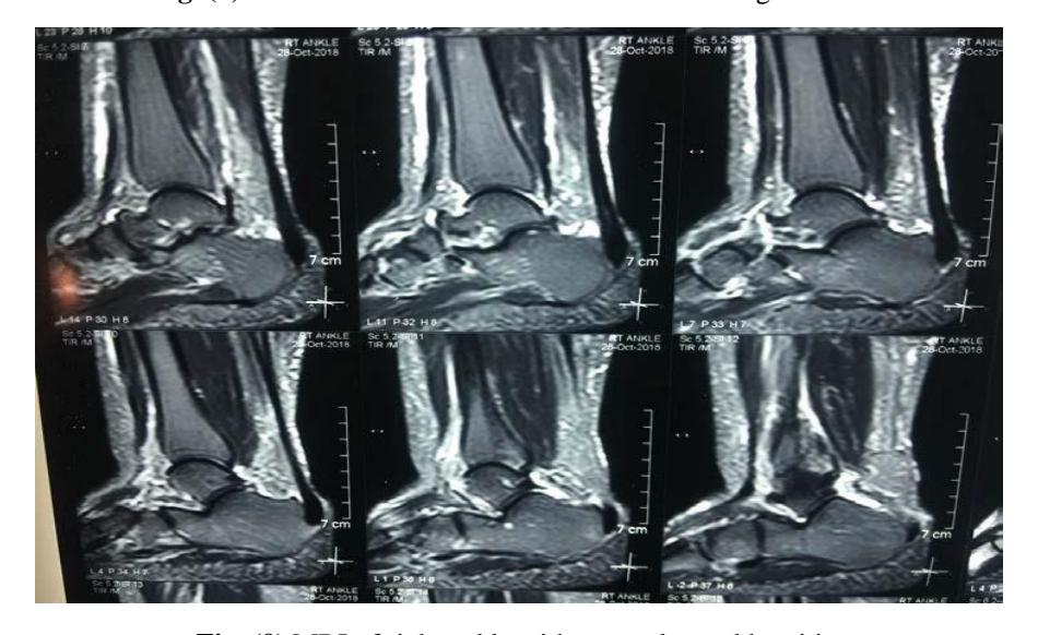
Fig. (9) MRI of right ankle with retrocalcaneal bursitis.