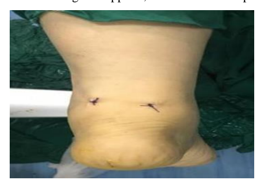
Fig. (19) Closure of portals with 2 mattress sutures.

The retrocalcaneal space was irrigated and suctioned to remove any loose tissue. The portal sites were closed with two skin mattress sutures(fig.19). A compressive dressing was applied, and the foot was splinted in slight equinus (fig.20).