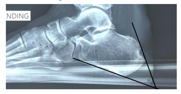
Fig. (23) Postoperative lateral xray of right ankle Postoperative AOFAS hindfoot scale at 6 months follow up: Pain (40) +Function (46) +Alignment (10) =96

Postoperative lateral xray of the ankle was done (fig.23).