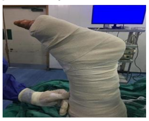
Fig. (20) Post-Operative below knee splint in equinus.