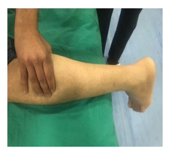
Fig. (4) Thompson test.