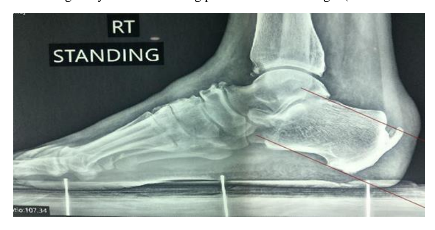
Fig. (6) Right standing x-ray of ankle with parallel pitch lines.