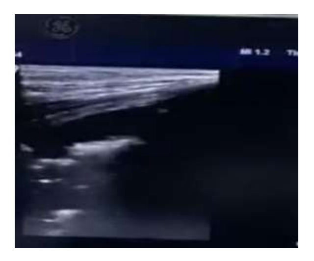
Fig. (2) show pleural effusion and air bronchogram. in ARDS