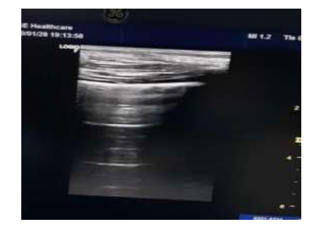
Fig. (3) spared areas in between AIS characteristic for ARDS