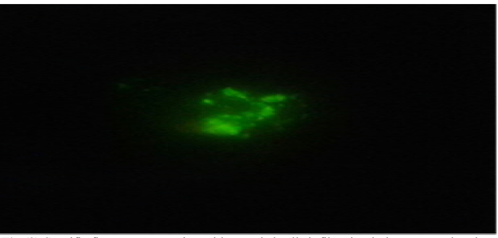
Fig (2) Specific fluorescent-reaction with rounded cells infiltrating in between and under the epithelial cells lining the CAM of cold freezed sections