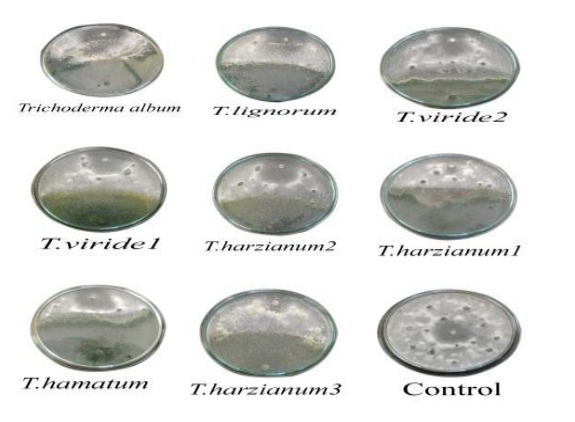
Fig (1)Effect of some species of Trichoderma on S. sclerotiorum growth