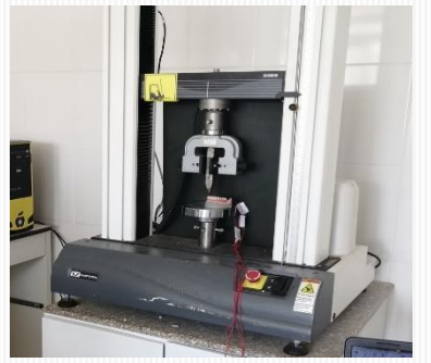
Figure (14) : Universal testing machine A four-channel strain-meter was used to assess the strains induced by the applied load.

Universal Testing machine<sup>26</sup> used for applying standardized vertical static loads ranging between 0-100 Newton on the loading points, which is equivalent to the moderate level of biting force. The loading device consists of a base, frame, model fixture and the loading point. The base made from a steel sheet of metal 1 mm in thickness with an inverted U-shaped form.(figure 14)