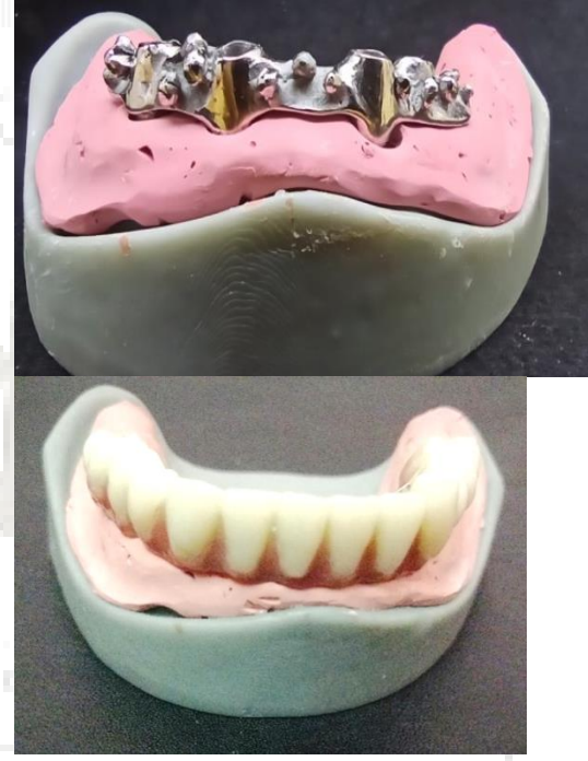
Figure (4): Metallic framework after finishing and polishing Waxing -up, flasking, wax elimination, packing and curing of the heat-cured acrylic resin followed by deflasking, finishing and polishing of the denture was done then the denture was tried to fit to the cast to be passively seated<sup>7</sup>. C-Model II: BIOHPP overdenture attached by screw retained abutments The titanium sleeves were screwed into place on the multiunit abutments the Reduction of titanium sleeves height was done by using a marker to mark proper height of the sleeves to the level of occlusal plan.

was performed using the cobalt chromium alloy. After divesting, finishing, and polishing the framework, when divesting the casting, it is important not to sandblast the abutment interface. Then finishing and polishing of the casting was done and checked for a passive fit (figure 4)