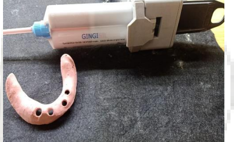
Figure (2): Gingival simulator 3-Preparation the lower cast for overdenture fabrication: A- Multi-unit abutment attachment: Angled multiunit abutments (screwretained abutments) attached to the peripheral implants whereas straight multiunit abutments attached to the central implants using hex screwdriver to ensure parallelism<sup>5</sup> (Figure 3)

Mucosa simulation was done via gingival mask material<sup>4</sup> (Figure 2).