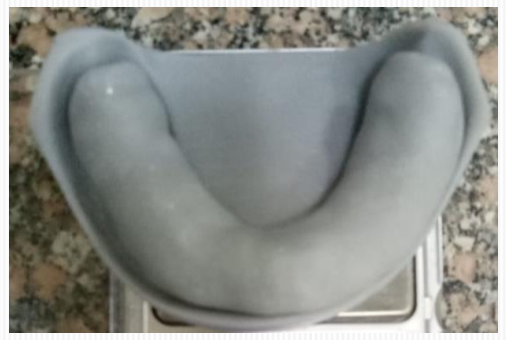
Figure (1): 3D printed cast. 2-Implant insertion and Simulation of the mucosa:

The raw material used in production of the printed item is a photopolymer, which in fact is a mixture of acrylic acid esters and photo initiator<sup>3</sup>. (Figure 1)