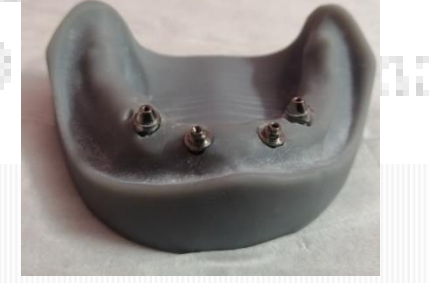
Figure (3): 3D cast with implants with multi-unit abutments.

Figure (2): Gingival simulator 3-Preparation the lower cast for overdenture fabrication: A- Multi-unit abutment attachment: Angled multiunit abutments (screwretained abutments) attached to the peripheral implants whereas straight multiunit abutments attached to the central implants using hex screwdriver to ensure parallelism<sup>5</sup> (Figure 3)