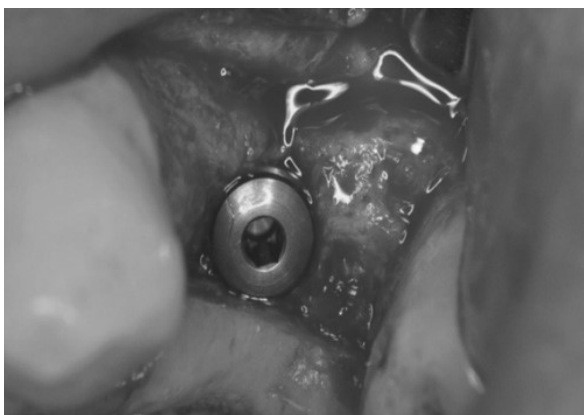
Figure (6): Implant in place and placement of cover screw.

3- An open flap reflection was done for core biopsy using trephine bur of 2.3mm diameter and 7mm length and placement of implant , and then flaps were closed (Silvio et al., 2017) figures (6).