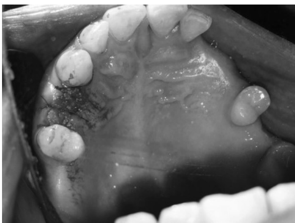
Figure 5: socket filled by Nano graft mixed with L-PRF.

9-Post-extraction instructions were given to the patient and medications were prescribed (Amoxicillin 500 mg, Metronidazole 500 mg twice/day and antiseptic chlorhexidine mouth wash for 1 week ) (Silvio et al., 2017).