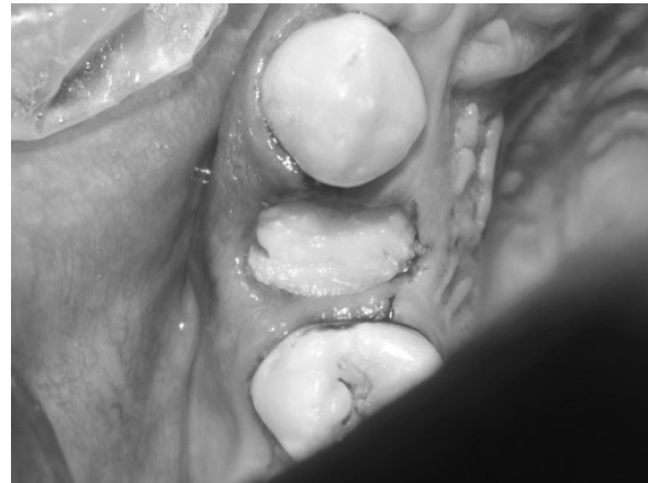
Figure 4: socket filled by L-PRF.

6- For group (II) socket was filled by L-PRF figure (4).