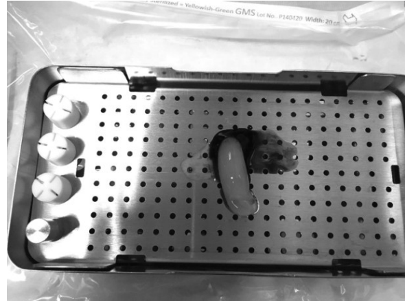
Figure (3): L-PRF box showing L-PRF

be removed from the tube and separated from the red element phase at the base with pliers. L-PRF clots will be squeezed between a sterile glass plate and a metal box to obtain L-PRF membranes, equal in size and thickness figures (3).