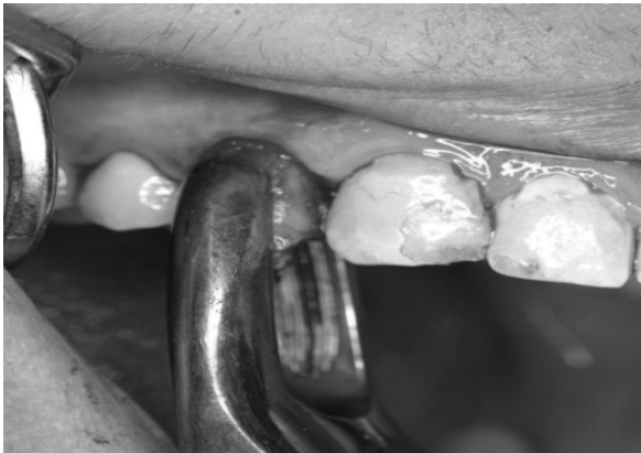
Figure (2): Tooth removal after luxation.

2- After administration of local anesthesia, atraumatic extraction was performed using periotome for severing the periodontal ligament with minimal trauma to the surrounding alveolar bone to facilitate removal of the involved tooth, to preserve bone and soft tissue then using extraction forceps for tooth extraction figures (2).