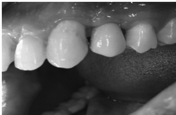
Figure (7): Final restoration three months later after implant placement.

4- Three months later patients received the prosthetic part of implant restoration figures (7).