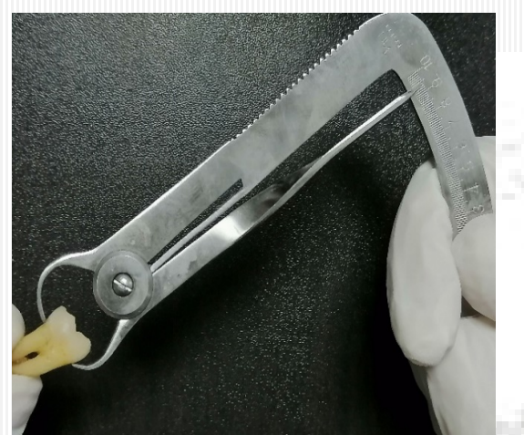
Figure (1): measuring with caliper

with resin using diamond stone . Each tooth was vertically mounted using a holding device (Figure 2) to ensure their placement with the long axis perpendicular to the horizontal plane in circular plastic mould with 2 cm diameter and 1.5 cm height then autopolymerizing epoxy resin was applied 2mm below the cementoenamel junction (CEJ).