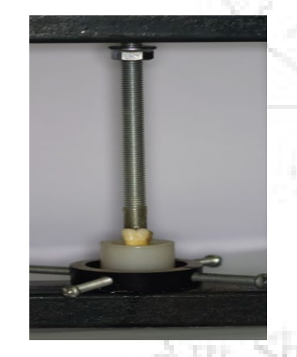
Figure (2): teeth mounting. Endocrowns preparation design:

Butt joint design was selected for this research. Gutta percha was removed till the canal orifice with no drilling inside root canals. Cavity preparation was made with copious water cooling using CNC special milling machine holding a high speed handpiece with a flat end diamond tapered stone having 10° taper to ensure a standardized 10° coronal divergence.