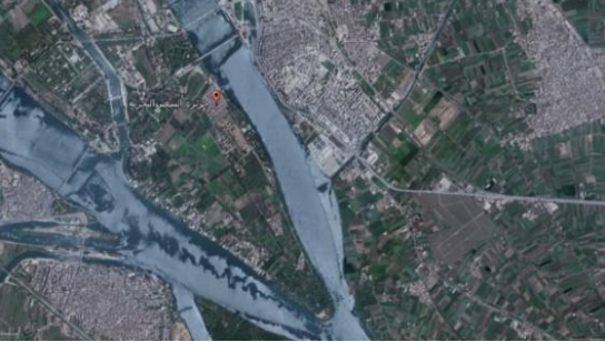
Figure (3) The urban development and change of its shape of Island in 1994, 2021