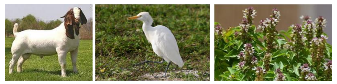
Figure (5) Biodiversity in Al-Shaeir Island.

All of these factors affect the formation of the island and take it the longitudinal shape as it is considered one of the permanent islands, and the analysis with satellite images shows that the barley island still maintains its shape in different aspects of it and not the shape of the island itself.