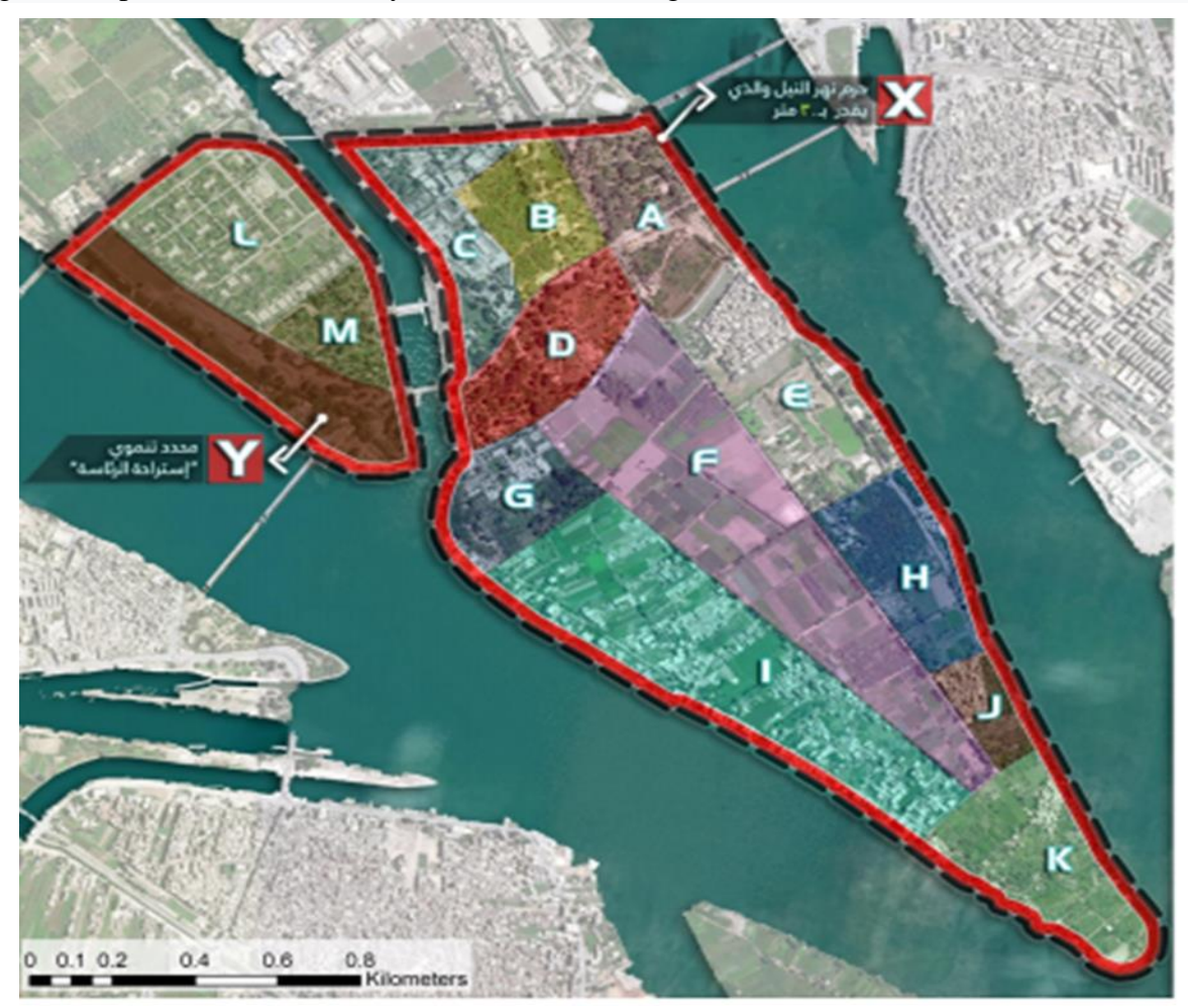
Figure (9) Environmental sensitivity mapping

The paper addresses sector (E) as the most suitable for urban development due to its low scale of sensitivity compared to other sectors (0.62), due to the existence of built-up areas to contain residential activities, and due to environmental original conditions as it contains plant life, but it is limited to small plants and some plantings only and also does not contain rare creatures, therefore it is more suitable for urban development and human activities in this rang. So the low sensitivity is a result of already existing urban development making more developments will have negative impacts on its sensitivity scale as shown in figure (9).