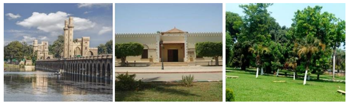
Figure (8) The Cultural Value of Al-Shaeir Island

Environmental methods must be required to rehabilitate them and to settle development activities because of their high social and economic return.