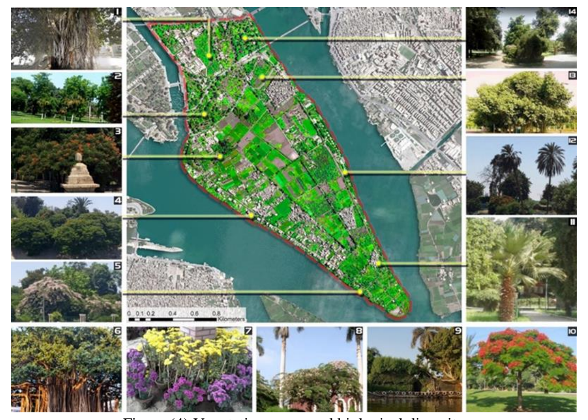
Figure (4) Vegetation cover and biological diversity

area of 20 acres with apiary — the animal production farm area 28 acres - the farm of the central administration of the stations and it has a livestock farm of 90 acres — a plant for propagating medicinal and aromatic plants, and an area of 20 acres as shown in figure (5).