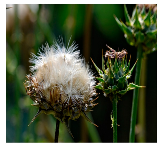
Figure (1): Morphology of Silybum marianum<sup>5</sup>

Modern alternative medicine is one of the most popular examples. Isolated Silybum marianum L, Germany Herb, also known as Mary Thistle and Mariendistel in English (Figure 1). Milk thistle is a family of Asteraceae (Compositae), one of the largest plant families. Initially as wild plants, it only grew in Europe and Asia, but are now widely grown and used for medicinal purposes and for food crops in North and South America <sup>5</sup>.