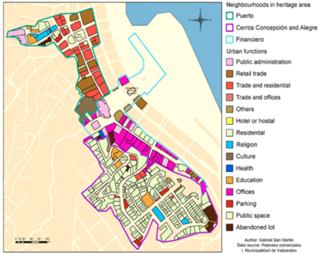
Fig. 1. Slots distribution on the heritage site of Valparaíso in 2003.

though the number of cultural plots has increased from 1 to 7 between 2003 and 2011, the number of commercial plots has risen from 16 to 76; reflecting the consequences of the exposure of the heritage site to tourism 17 . The designation of heritage brought new issues; especially as regards the socio-spatial problems of the city. During 2003 to 2011, 6,926 new commercial licenses were granted, and the residential area of the heritage site diminished 40% (Figure 1 and Figure 2). Furthermore, Valparaíso ranks highly as the region with most creative companies in the country - 1,273 creative firms 18 - mainly an effect of the re-generation that the city is experiencing.