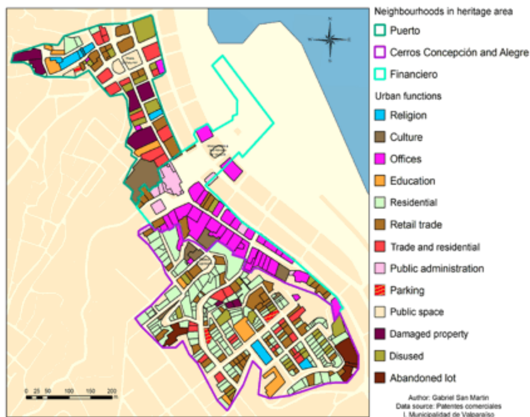
Fig. 2. Slots distribution on the heritage site of Valparaíso in 2011.