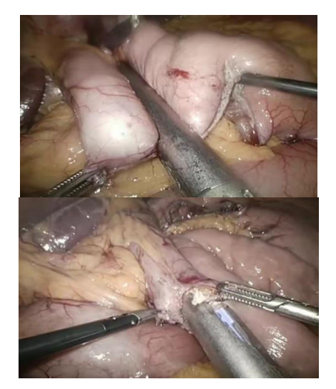
Fig.3. Performance of the gastric section and End-to-side gastro-jejunostomy

MGB was performed by preparing a gastric pouch and tailoring a mechanical linear wide gastrojejunal anastomosis at 150 cm from the ligament of Treitz( Fig. 4 ).