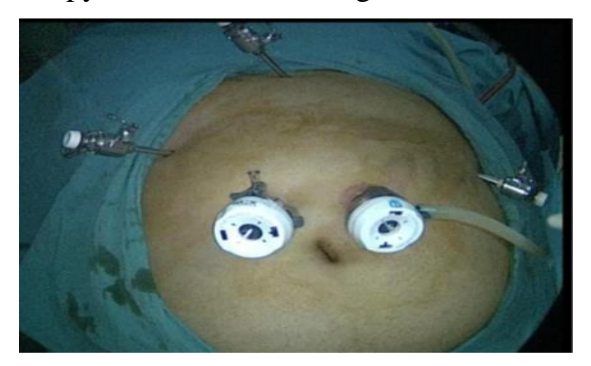
Figure. 1 Port distribution

dissection of the fundus. The anesthetist introduces a 34-Fr bougie trans-orally up to the pylorus to guide the stapling and maintain an adequate lumen of the gastric sleeve. Transection of the stomach begins on the antrum 2 cm or 6 cm proximal to the pylorus towards the angle of His.