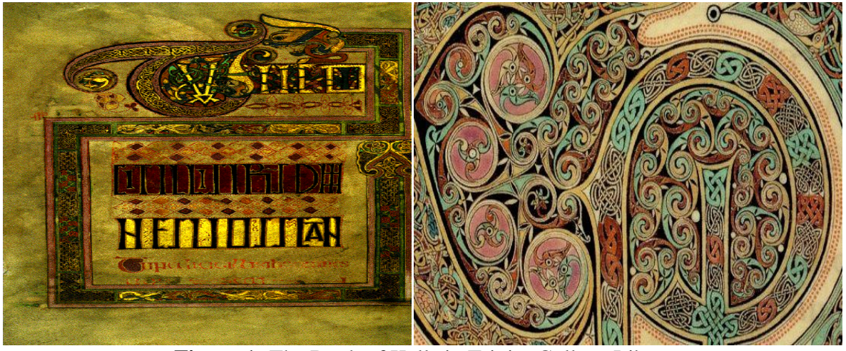
Figure 1: The Book of Kells in Trinity College Library

Moore is inspired by the ancient crafts instead of being captured by the new CGI animation technologies. In this sense, The Secret of Kells is an expression of the immediacy-hypermediacy dichotomy in which old artistic crafts are juxtaposed with new technologies. The Holy Book in Trinity College Library is an ancient manifestation of Aidan's "magical book" in the 2009 animated feature film: "The Book of Iona outshines all others because of the miracle of Coloumbkille's Third Eye" (Moore 2009):