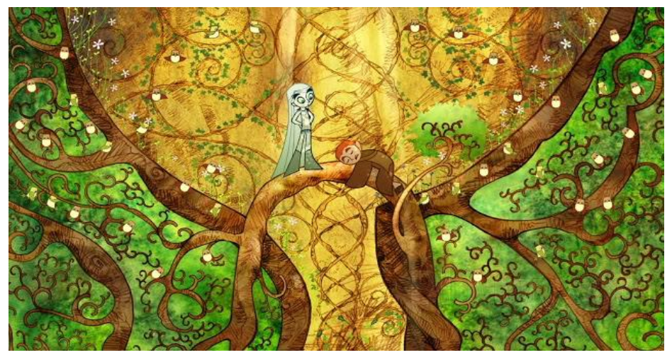
Figure 4: The Intricate Forest in Remediation of the Manuscript's Illustrations

Herein lies the vital strength of animation to remake the medieval art of the Book of Kells by imitating its artistic features in the modern animated images. Brendan is a fictional character, yet the Book of Kells does exist within a remediating relationship in which the newer and the older forms are "involved in a struggle for cultural recognition" (Bolter 14).