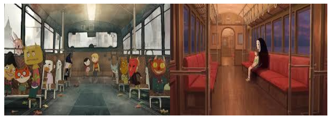
Figure 13: Song of the Sea as a Textual Ghost

Celtic symbolism is fused with the Eastern artistry of Orientalism to produce the distinctly exceptional aesthetics of Song of the Sea . This reveals how animation is made by animation to evaluate the 'literariness' of intertextual reference. Affinity is set between the Bus Scene in the Song of sea and the Train Scene in Spirited Away . This media reference is the reproductive impulse of appropriation to analyze how motion picture feeds off and creates other ones. This performance of re-vision highlights the act of looking back to create a heterogeneous animation or a " Celtic Miyazaki-esque " (Noisewar Internetlainen 2015) flat-footed animation.