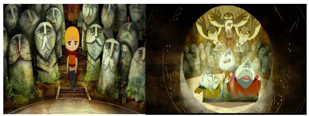
Figure 15: The Stone Faeries as Remediation of the Celtic Rock Art

The vivacity of the flower is juxtaposed with the grey tones of the city to highlight the vibrancy of magic in contrast to the muteness of the city. This underlies the concept of the "sacred landscape" (Hicks 40) to signify the celebration of folkloric countryside since the animation centers on the lives of selkies to honor and respect them. The stone faeries are illustrated to speak of the sacredness of the mythic landscape: