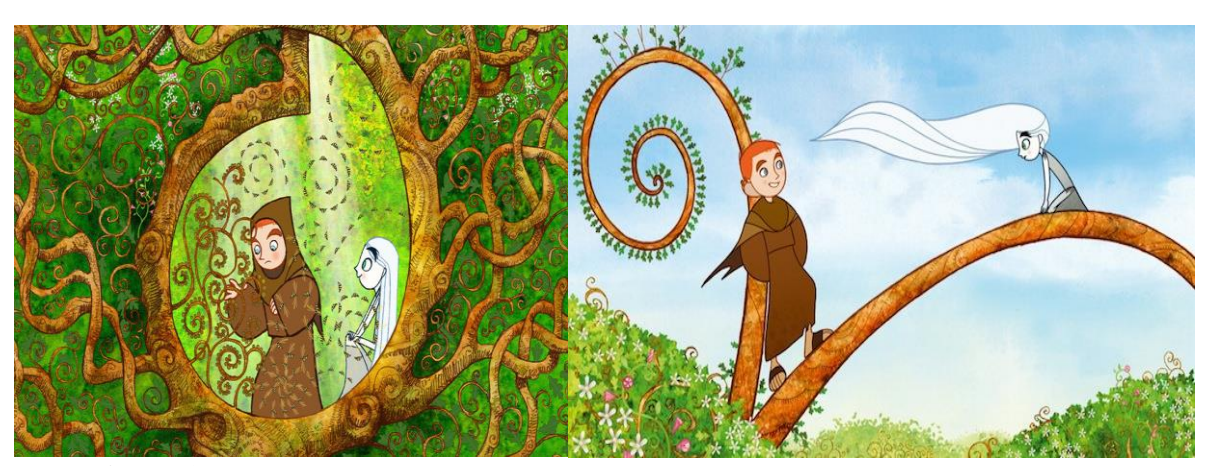
Figure 3: From the Walled City to the Enchanted Forest with the White Wolf/Girl

Experienced by Brendan To attain individuation and a sense of Wholeness