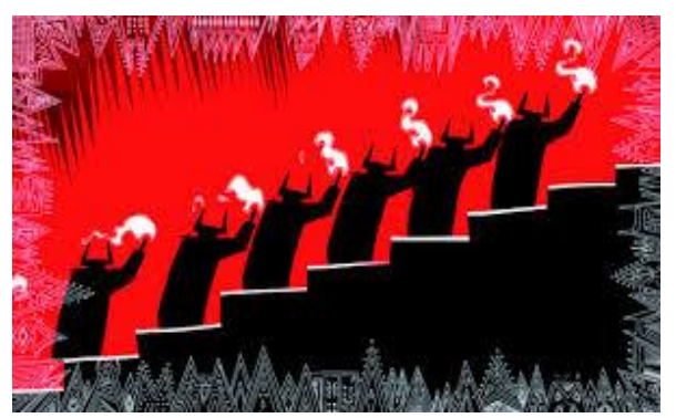
Figure 6: The Viking Invaders in Geometrical Shapes

The depiction of the Northmen is in severe contrast to the villagers of Kells in the sense that the villagers are composed of curved lines and circular shapes whereas the Viking invaders are rendered in geometrical abstract faceless figures in square with sharp angular shoulders: