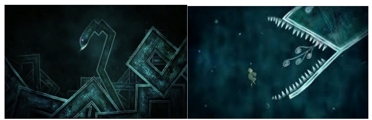
Figure 10: Crom Cruach: The Celtic Dark Deity of Death and Destruction

Animals - in the enchanted forest - are symbolic significations of the eternal conflict between good and evil since they are depicted in either rounded or angular shapes to reflect different attitudes and sentiments. Brendan's initial encounter with the wolves is fearful since they attack him with their exaggerated teeth and pointed corner ears. However, Aisling herself – as a wolf girl – is in smooth rounded shape to convey her intimacy with the young illustrator. Crom Cruach is a huge snake-like creature in sharp angular form: