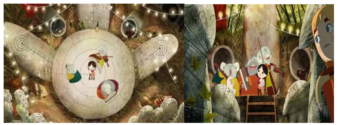
Figure 18: Saoirse and the Fae Folk within their Roundabout Haven

Celtic spirals are set on the stone statues and there is also a feather carving on the wall behind the characters used to be worn by pagan Irish singers: