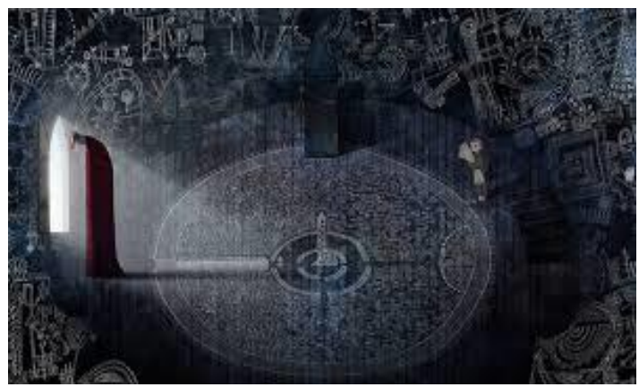
Figure 5: The Scriptorium

The animation style of contrasting lines and curves is manipulated to symbolize settings, characters and animals. Kells – the walled city – is rendered in a cubist-like perspective to illustrate the fact that Kells is an amalgamation of curves and lines: