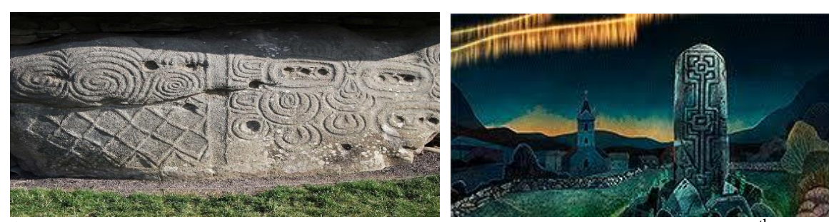
Figure 16: The Kerbstone Rock at Newgrange in County Meath, Ireland dates to 5<sup>th</sup> century is remediated in the 2014 animated film

It is noteworthy that the stone faeries have "spirals, arcs, and zigzag motifs which are characteristic of both Irish passage tombs and rock art of the Neolithic period" (O'Kelly 94):