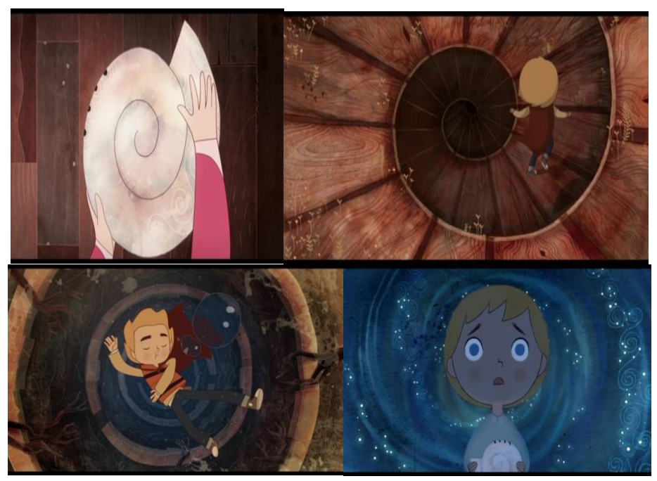
Figure 17: Magical Spirals

These visuals act as "transmutation or transcoding" (Hutcheon 16) in the sense of being recoded into a new set of filmic mirroring. In other words, remediation occurs in the form of intersemiotic transposition from one sign system to another.