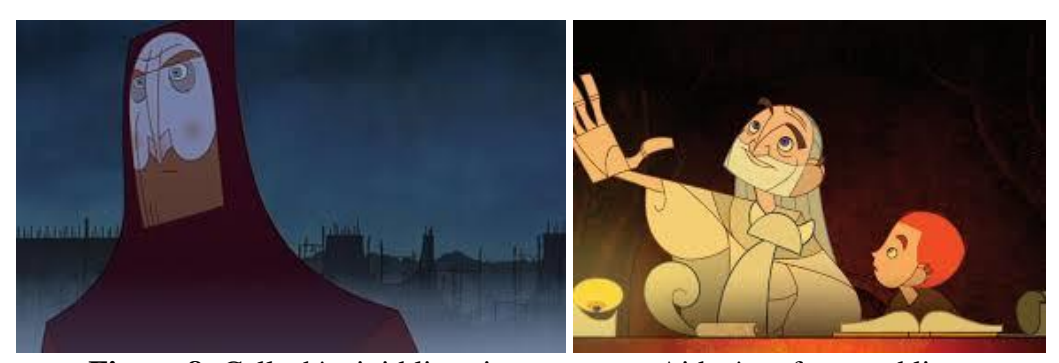
Figure 8: Cellach's rigid lines in contrast to Aidan's soft curved lines

Abbot Aidan's ideology of spiritual knowledge is juxtaposed with Abbot Cellach's obsession with the construction of the wall as echoed in his colossal height in rigid lines: