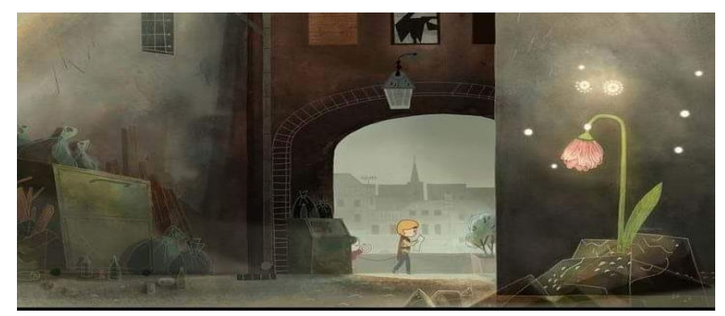
Figure 14: The Duality of Real and Magical Worlds

The association between the Natural world and the Human world is manifested in the amalgamation of both worlds in surreal visuals depicting Ben in their centers: