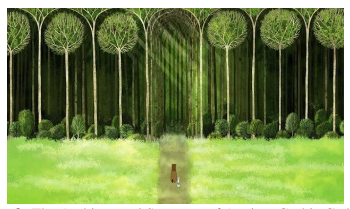
Figure 9: The Architectural Structure of Ancient Gothic Cathedral

The forest entrance evokes the ambiance of the ancient gothic cathedral. The forest is a hybrid of rounded surfaces and rigid lines as illustrated in its architectural structure: