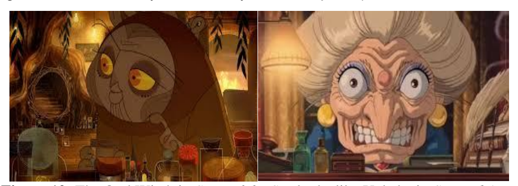
Figure 12: The Owl Witch in Song of the Sea looks like Yubaba in Spirited Away

Song of the Sea illustrates the influence of Miyazaki's Japanese anime Spirited Away (2001) within an enterprise of "plural stereophony of echoes, citation, references" (Barthes 160) to create a fluid animation. Both Miyazaki – "Walt Disney of Japan" (MacWilliams 48) - and Moore are postmodern performers/animators for not favoring Disney Studio and the hyperstylized computer generated imagery of PIXAR as well as in their genuine endeavors to reconfigure ancient national symbols and myths in meta-fantasy realms: