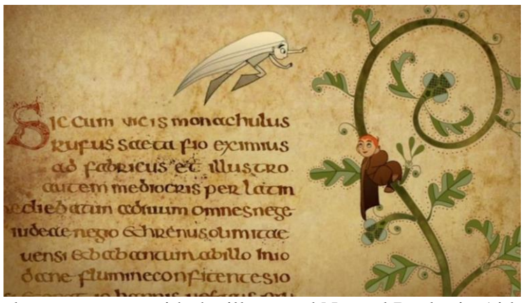
Figure 2: Brendan communes with the illustrated Natural Realm in Aidan's manuscript