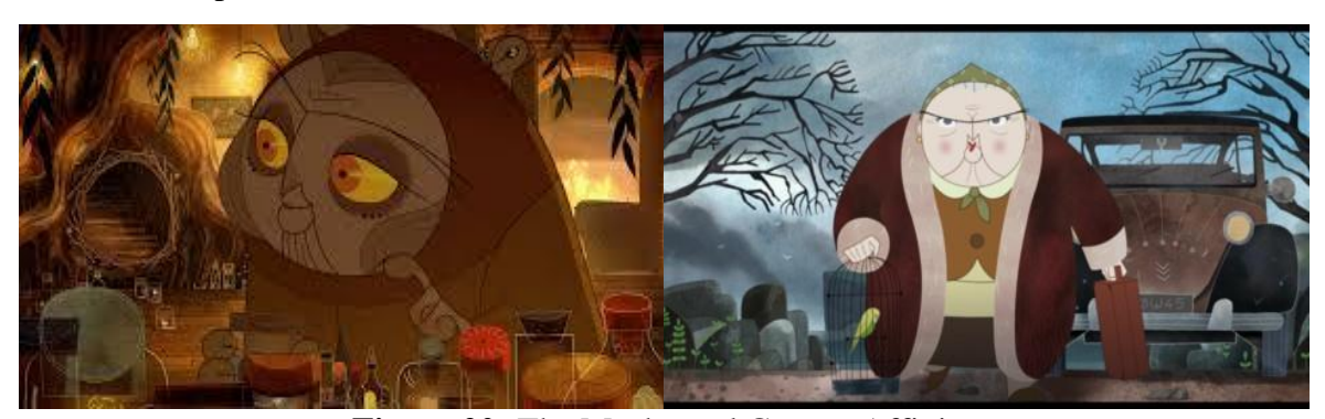
Figure 20: The Macha and Granny Affinity

Wells illuminates that it is desirable to "embrace the artifice and illusionism of animation, so that you are able to create 'plays within plays' or 'films within films' to condense your plot, but more importantly, to 'illuminate' a supposedly-known or taken-for-granted world, from a different perspective" (2006: 33). On the one hand, an affinity is drawn between the Owl Witch Macha - known in the Irish folk belief as "a presage of death" (Hógáin 57) and Mac Lir's mother. On the other hand, Granny looks like the Owl sharing the same facial features and expressions: