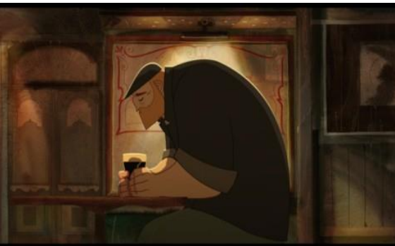
Figure 19: Mac Lir in the background in the form of a stone concretizes symbolically the human character Conor

The stylistic quality of the mise-en-scène interacts to craft "the overall composition in which characters do not exist within a setting but rather from visual elements that merge with the setting" (Brodwell & Thompson 113). Mac Lir - as a stone island to symbolically reflect Conor's inner mental suffering - creates an aesthetic harmony to comprehend Conor's dismal physical posture drawing the scene closer towards abstraction and metaphoric mise-en-scène.