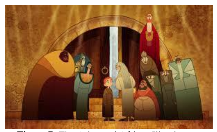
Figure 7: The Asian and African Illuminators

The Viking hordes are illustrated as "shadowy blocks with rudimentary horns and glowing eyes, abstract figures of chaos" (Renshaw 2010) in frenzy red color attacking Kells savagely. The diversity of the villagers is juxtaposed with the uniformity and sameness of the Vikings. Brothers Assoua and Tang are completely different in appearance: