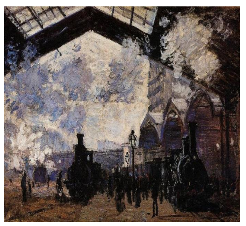
In a Station of the Metro, (1913), (Pound 48). Figure (3)