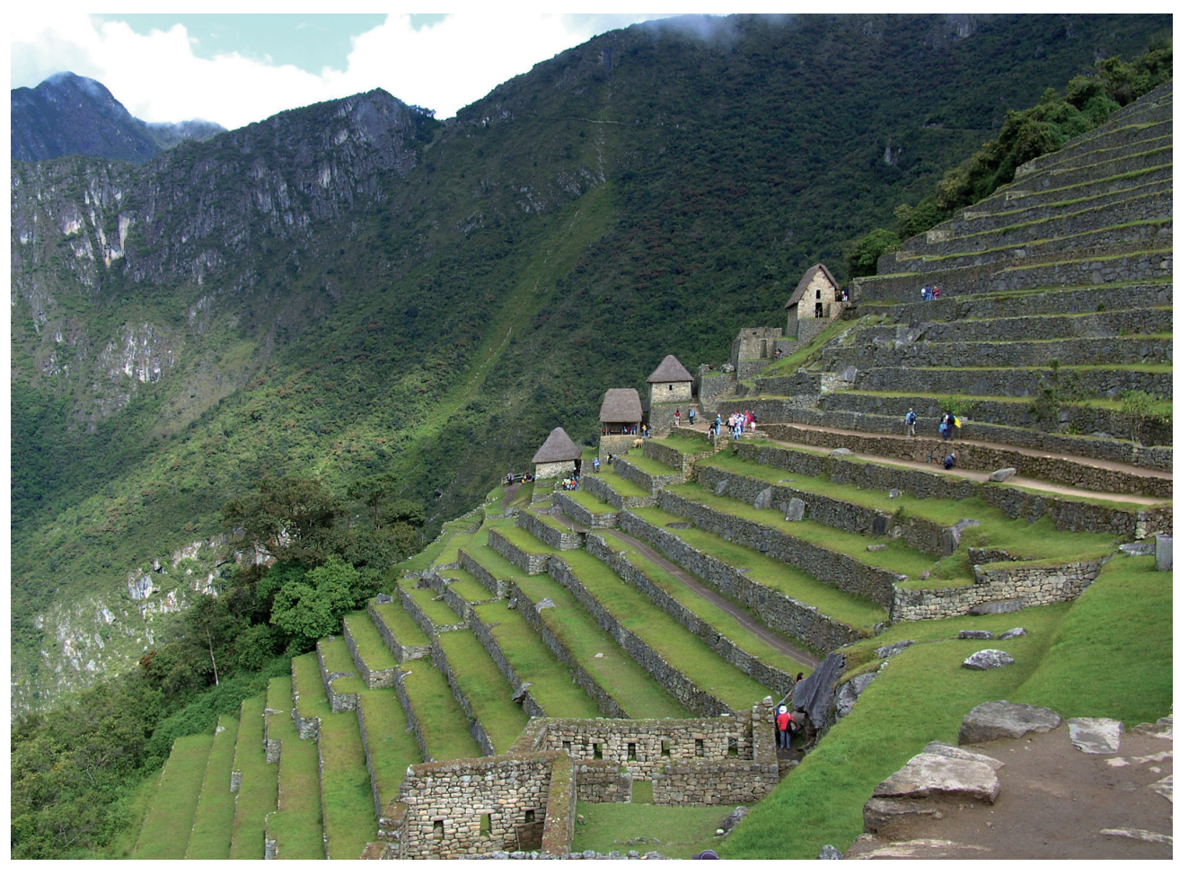
Fig. 2 Inca stone terrasing systems in Machu Pichu.

Many rivers were canalised as the Río Urubamba near the village of Pisac to conserve