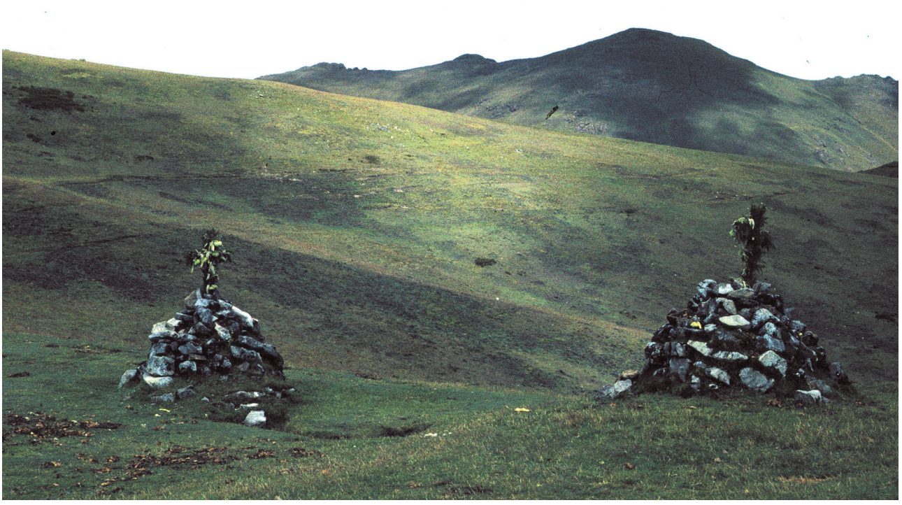
Fig. 1 Barren landscape in the Andes, Photo Inge Schjellerup

"the Spanish camped in the cotton tents they carried, making bonfires to protect themselves against the cold of the mountains.. these great heights, which are bare and covered with grass as short esparto grass... and the water is so cold that it gives men a chill to drink it".(Jerez 1947).