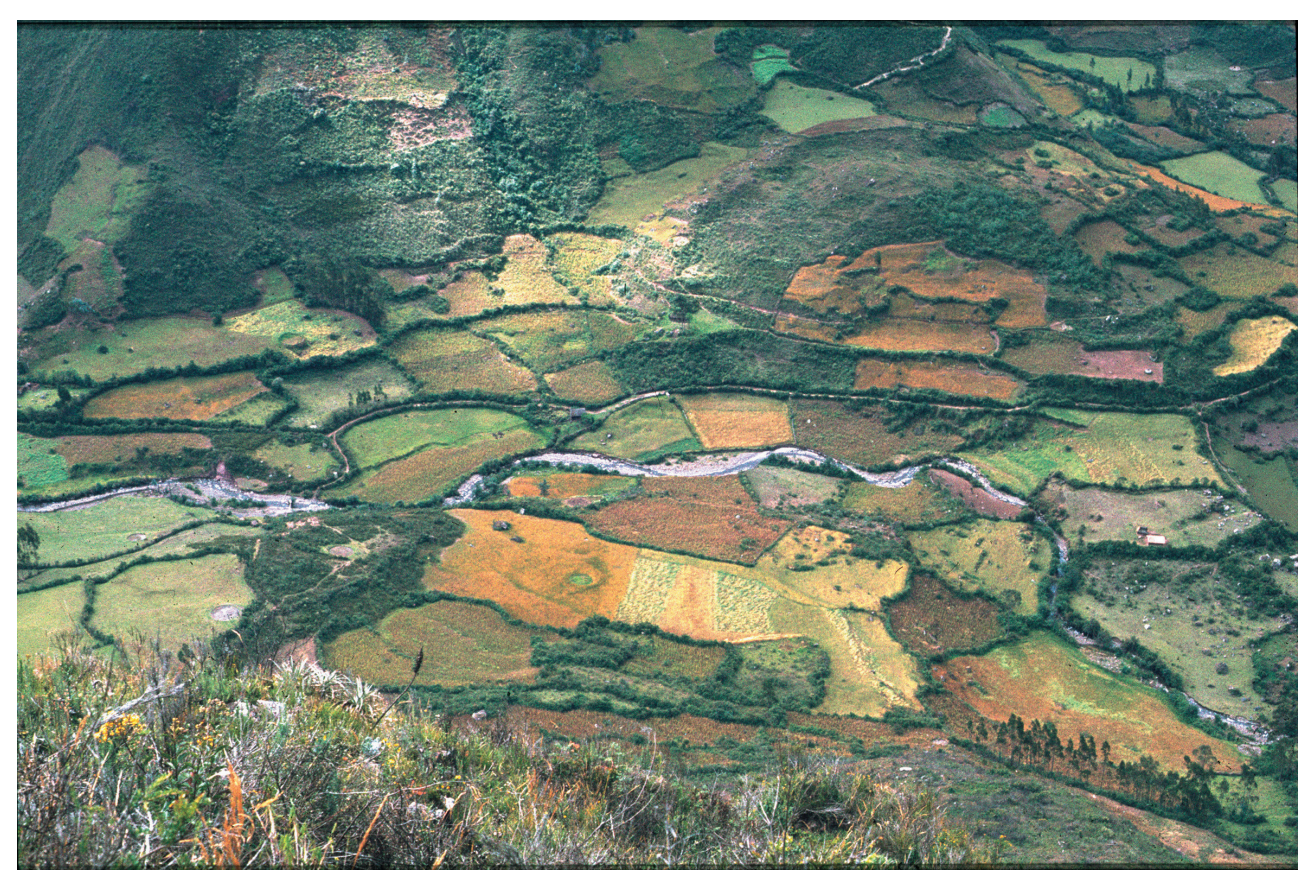
Fig. 8 Contemporary fields in the bottom of the Chuquibamba Valley.

The hamlet La Morada is a typical example of a settlement founded in the Ceja de Montaña as late as 1985 by one family, who originally came from the highlands. The family left Chuquibamba because land was scarce and