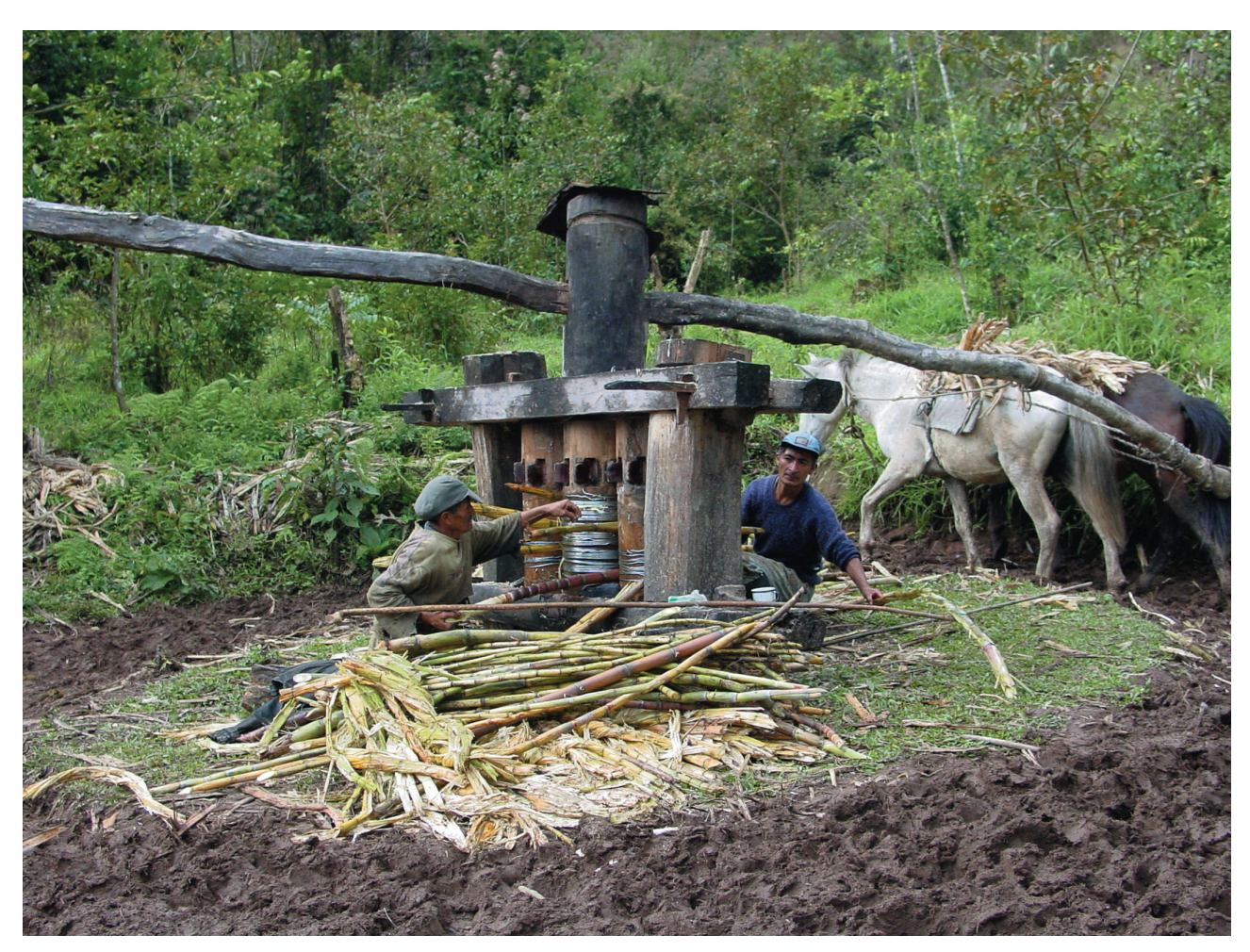
Fig. 4 Working sugar mill in Chilchos.

Shipbuilding was another industry, which earlier demanded large amounts of timber. The pre-Hispanic sea transportation consisted of large rafts made of balsa tree. However, the Spaniards were used to quite another style of ships, and the ongoing contact with the mother country, on the other side of the ocean meant, the need of more vessels. (Fig. 5)The dangerous journey on the Pacific Ocean to Panama where the goods were unloaded to be shipped onto the