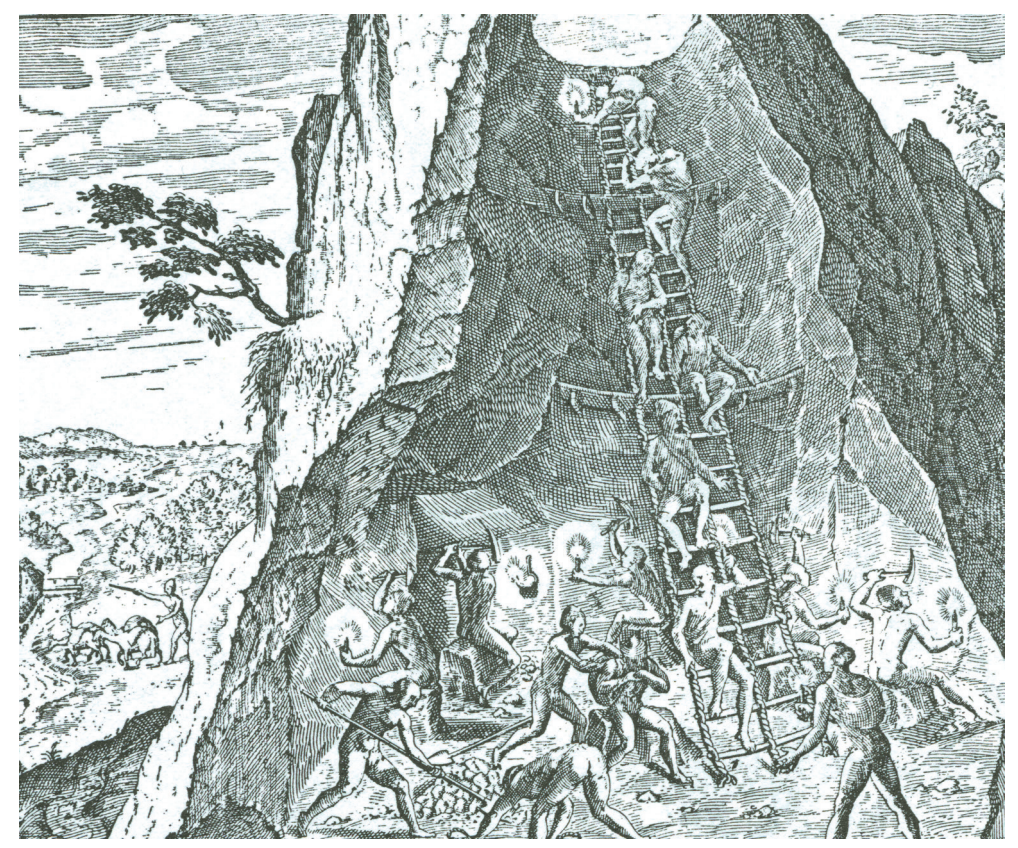
Fig. 6 The Potosi silver mine. Engraved by T. de Bry 1590.

Outside Potosi , an area of 30 km was contaminated by the smokes from the mines and no trees left. The landscapes around the mining industries are even today quite shocking. The waste from the mines is thrown down the barren mountain slopes. The air is filled with metal particles so one can hardly breath and the average age is from ten to twenty years below the national average. The mining centres in Pataz, Cerro de Pasco and Hualgayoq and Yanacocha in Cajamarca have left the landscapes barren and unproductive for centuries to come.