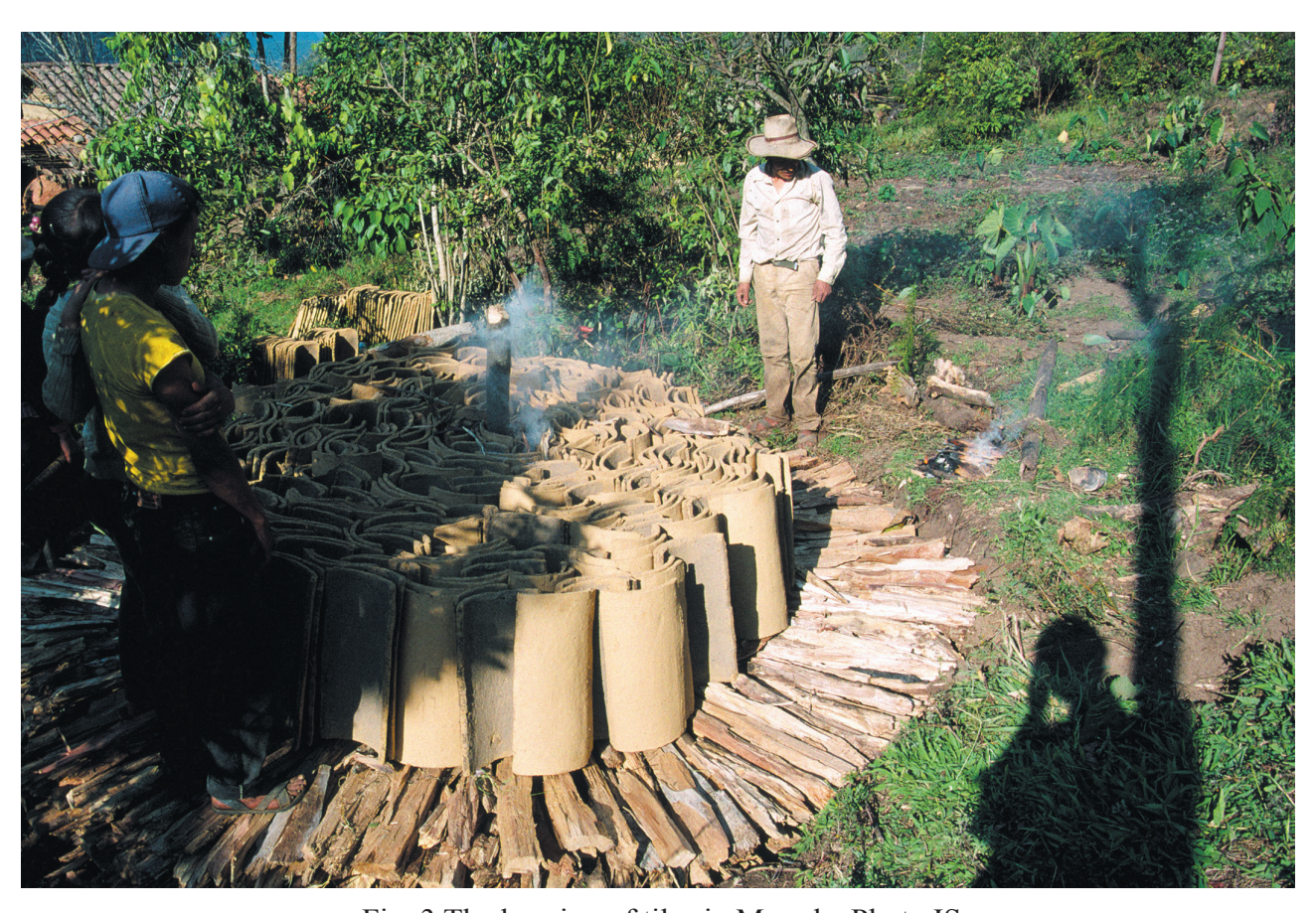
Fig. 3 The burning of tiles in Morada.

A large fabrication of charcoal was another big consumer of trees as the Spaniards used it to heat their houses in big braziers. Heating of the houses was not known in the indigenous society before. The Incas knew of charcoal but the Spaniards greatly expanded its production. Spanish regulations were introduced to limit the production: