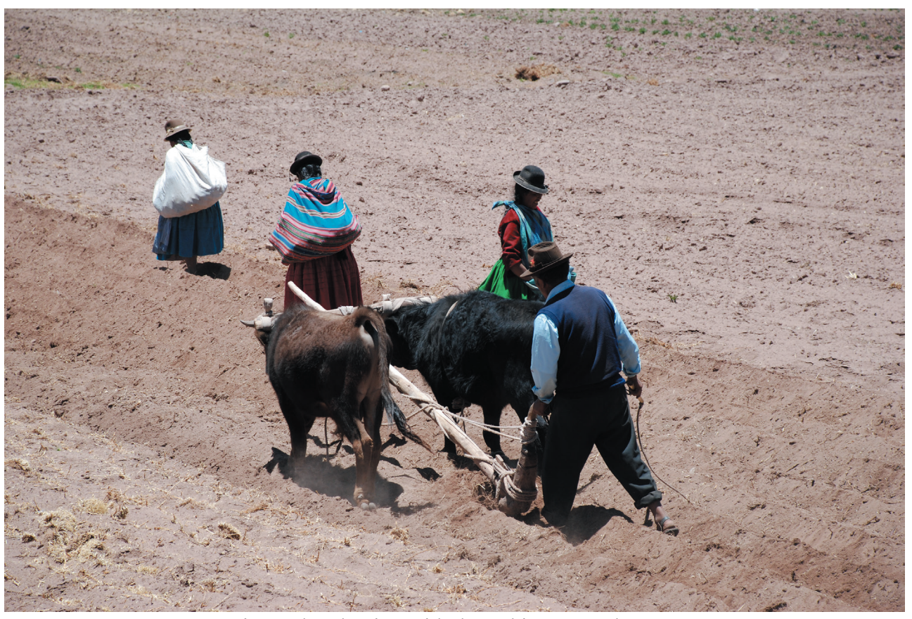
Fig. 7 The plowing with the ard in Puno. Photo IS

indigenous people. The pressure on the use of land was considerably higher even taking into consideration the drastic depopulation.