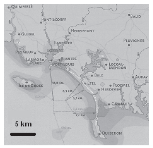
Figure 3: Location of the planned mining site and of the coastal sedimentary cell from Port Louis to Quiberon.

In Southern Brittany the situation is shown on figure 3. The coastal dune system extends from Port Louis to Quiberon. The source site is Port Louis, close to Lorient, which is an artificial tombolo build by the French navy during the 17<sup>th</sup> century [4].