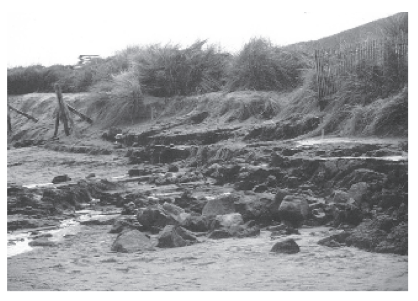
Figure 2: Impact of the March 1998 storm on an archeological coastal site close to Saint Malo.

The storm destroyed the entire system and dune management works had to resume. The cost (at this moment) was about 300 French francs (about 45 Euros) par linear meter of coastline. Very close to this dune a cliff cut into soft material (coluvium and inherited glacial drifts) had receded by more than one meter. A detailed survey showed that most of the eroded sediment from the cliff had been moved to the sub tidal zone, at about 2 to 4 metres below the low tide level. Some of the eroded dune sediment was actually stored within the tidal zone