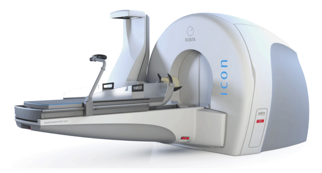
Figure (1): Leksell Gamma Knife® Icon<sup>TM</sup>.

> One patient had neurological deficit received corticosteroids.