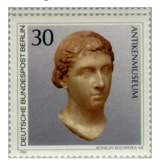
Figure 5: The German Stamp of Cleopatra

posthumous portrait of Cleopatra VII erected in Mauretania by her daughter Cleopatra Selene, during the time of the later marriage to Juba (Bianchi, 1988).