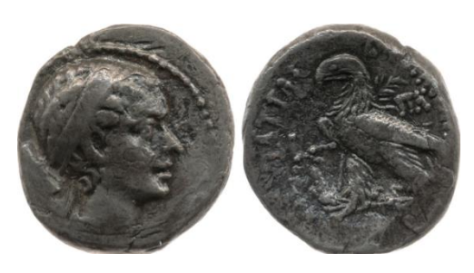
Figure 2: Coin of Cleopatra VII minted in Alexandria: a coin of silver tetradrachm, on the obverse is a portrait of Cleopatra wearing a diadem, and on the reverse an inscription reading "BAΣΙΛΙΣΣΗΣ ΚΛΕΟΠΑΤΡΑΣ" with an eagle standing on a thunderbolt.

Production date: 47 B.C – 46 B.C London, British Museum: 1857,0822.46