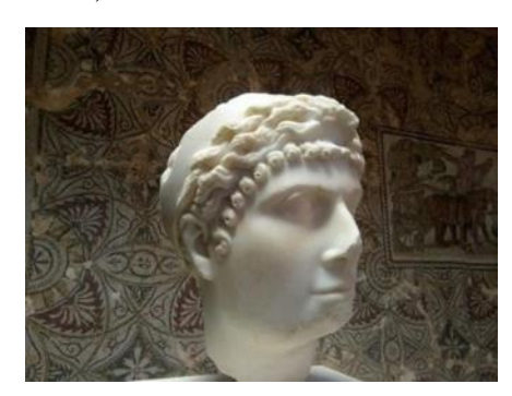
Figure 6: Marble portrait of Cleopatra VII's or perhaps of her daughter, Cleopatra Selene

The third marble portrait head probably of Cleopatra (fig.7) was found in the harbor area of Cherchell, modern Algeria, which was part of the kingdom of Mauretania in Cleopatra's time. It is now in the Cherchell Museum, Algeria. It shares the same cast, hairstyle, and diadem as the Vatican and Berlin heads and must be based on the same Alexandrian prototype (Stanwick, 2002).