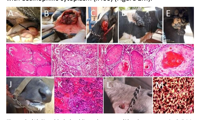
Figure 2. (A) Firm bleded sublingual masses, (B) vulvar masses in 2 Frisian cows, (C) friable easily bleded ocular mass in cow, (D) multi-lobulated suprascapular masses, (E) mammary gland masses in Frisian cattle calves. The corresponding H&E stained sections showing destruction of epidermal cords with proliferation of neoplastic cells (x200) (F), embedding of neoplastic cells of SCC in the dermis within neoplastic stroma (x200) (G), formation of nests that composed of polyhedral prickle cells that supported by a moderate amount of fibrovascular stroma (x200) (H,I), Keratinization within cords or nests results in central, eosinophilic accumulations of compact laminated keratin surrounded by tumor cells (x200) (J). Multilobulated area at the base of the lower lips (K) and its corresponding H&E stained sections showing basal cell carcinoma with neoplastic cells arranged in lobules and embedded in a moderate amount of fibrovascular stroma (x200) (L). Single ulcerated facial nodule (M) and its corresponding H&E stained sections showing melanosarcoma with pleomorphic small spindle, polyhedral rounded and spindle shaped melanin cells that appearing in groups densely packed with melanin granules with eosinophilic cytoplasm (x400) (N).

moderate amount of fibrovascular stroma (x200) (Figure 2H;I), and nests keratinization with central eosinophilic accumulations of compact laminated keratin surrounded by tumor cells (x200) (Figure 2J). Histopathological examination of the BCC showed neoplastic cells arranged in lobules and embedded in a moderate amount of fibrovascular stroma (x200) (Figure 2L). Histopathological examination of the melanosarcoma showed pleomorphic small spindle, polyhedral rounded and spindle shaped melanin cells that appearing in groups densely packed with melanin granules with eosinophilic cytoplasm (x400) (Figure 2M).