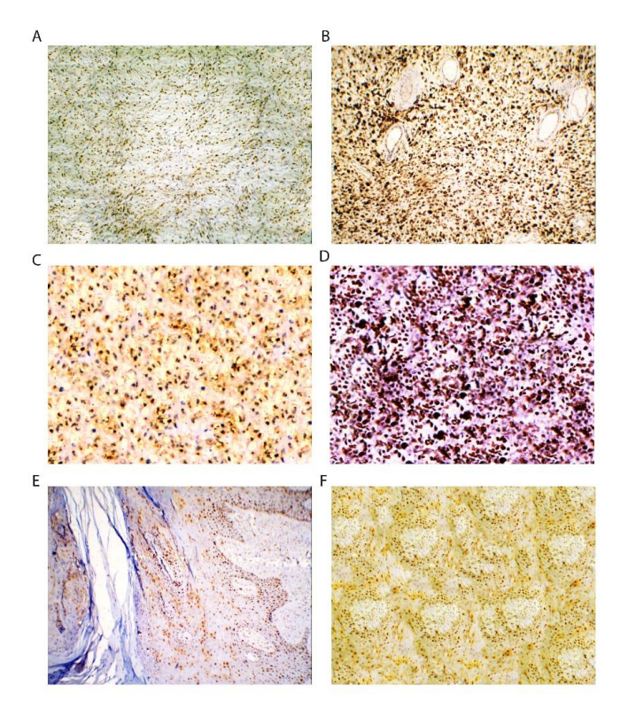
Figure 3. Immunostained sections for Ki67 showing nuclear positivity from different types from benign and malignant neoplasm, (A) fibroma (x200), (B) fibrosarcoma population of ec (x100), (C) myxoma (x200), (D) myxosarcoma (x100), (E) papilloma (x100), (F) tumor cases [9]. squamous cell carcinoma (x400).

Head was the most common affected site in the body (46/75) and the recorded tumors were originated from the cheek (1 Myxoma and 1 Melanosarcoma and 1 Fibrosarcoma), muzzle (2 Papilloma), oral cavity (1 SCC), Ear (1 Lipoma and 1 BCC), eye (21 SCC, 8 Corneal dermoid and 1 Papilloma), 3rd eyelid (3 Fibroma and 5 BCC). Tumors from sexual organs and mammary gland placed the second (14/75) and originated from vulva (2 papilloma, 1 fibroma, 1 Myxosarcoma and 1 BCC); vagina (2 SCC); teat (4 fibroma); mammary gland (1 SCC); penis (2 Fibrosarcoma); tumors originated from the trunk were (6/75) (3 papilloma and 3 SCC); tumors originated from the neck were (5/75) (4 SCC and 1 Lipomyxoma) and tumor originated from the limbs were (4/75) (papilloma, Teratoma and 2 SCC).