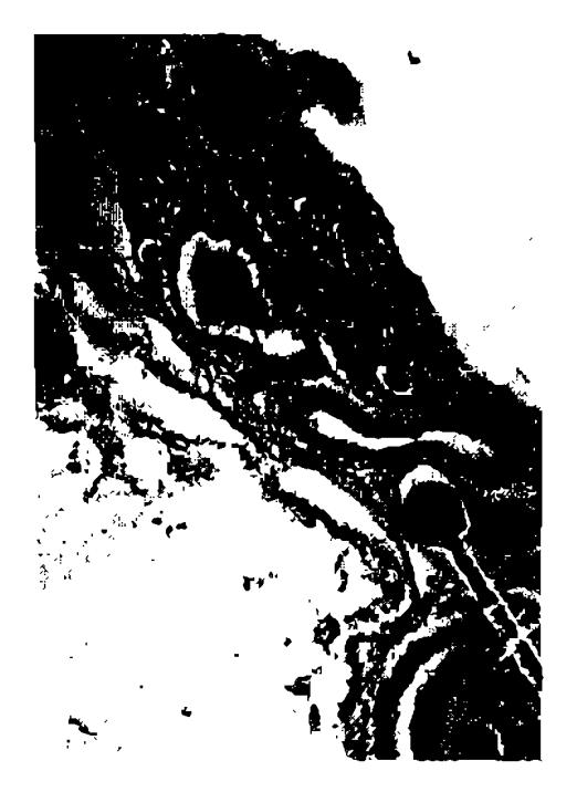
Fig. (7): Wall of air sac showing thickness with nodular formation (H & E : 150).