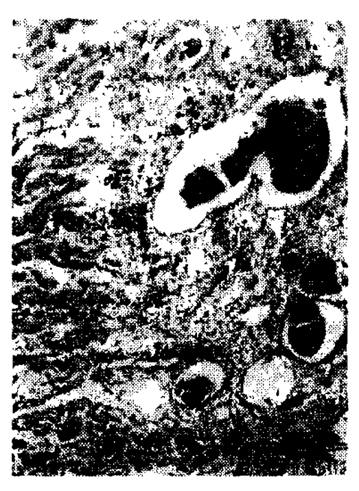
Fig. (11): Heart showing thickening of the epicardium, necrotic nodules and lymphocytic infiltration (H & E x 150).