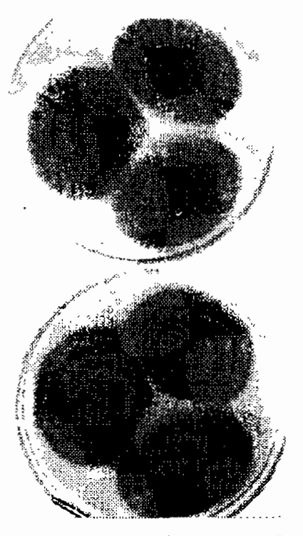
Fig. (3): Aspergillus culture on Sabouraud's agar.