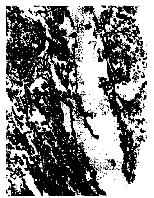
Fig. (6): High power of fig. (5) showing the hyphae, giant cells, granulomatous nodules (H & E x 300).