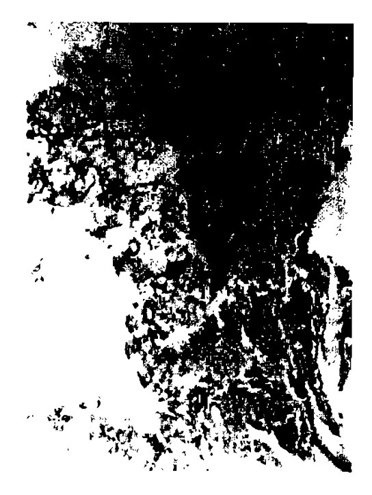
Fig. (5): Lung showing areas of granulomatous necrosis, inflammatory cell inflitration, fibrosis and fungal hyphae (H & E x 150).