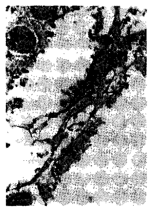
Fig. (9): High power of fig. (8) showing the nodules (H & E x 300).