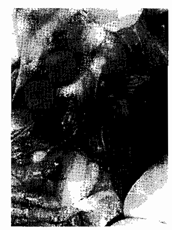
Fig. (1 and 2): Caseous nodules on lung (L), air sacs (A), liver (V) and heart (H).