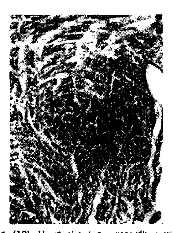
Fig. (12): Heart showing myocardium with lymphocytic infiltration (H & E x 150).