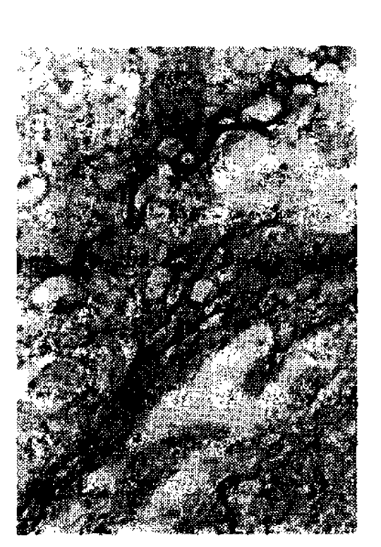
Fig. (10): Wall of air sac showing hyphae, spores and granulomatous nodules (H & E x 300).