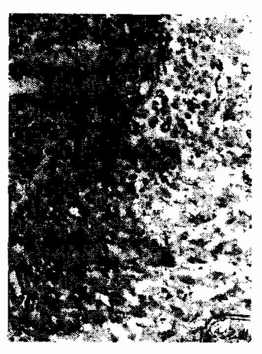
Fig. (15): Liver showing necrotic area and heavy reactive inflammatory cells, notice newly formed bile ductules (H & E x 300).