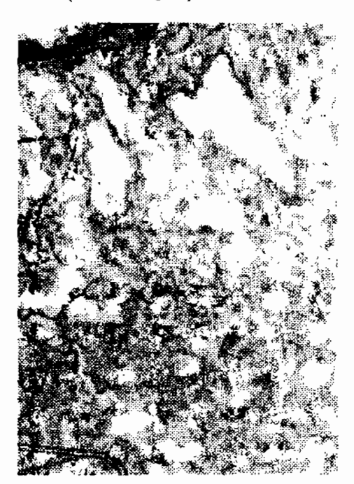
Fig. (18): Liver showing hyphae and hydropic degeneration of hepatic cells, notice the hemosidrosis (If & E x 600).