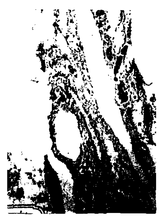
Fig. (8): Wall of air sac showing hyphae and granulomatous nodules (H & E x 150).