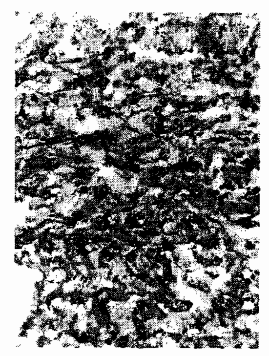
Fig. (13): Heart showing fungal hyphae (H & E x 600).