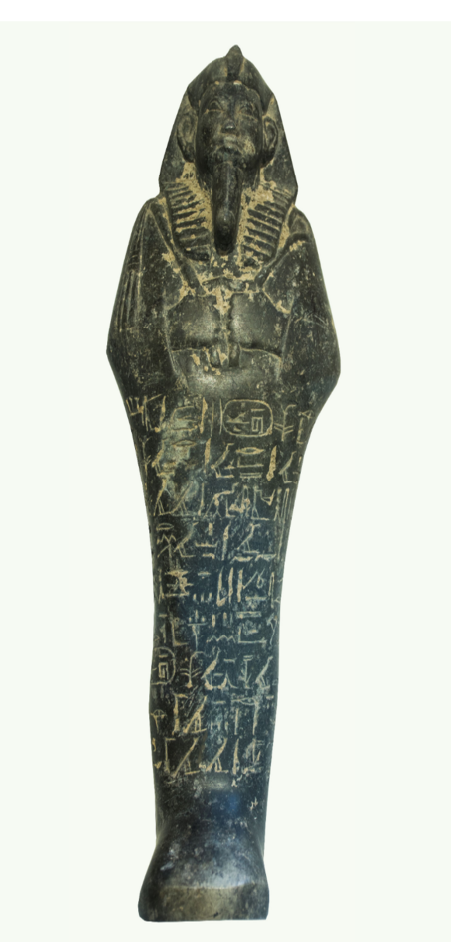
(Fig. 13) Shabti of Taharqa, Egyptian Museum, Accession Number: JE 46509.