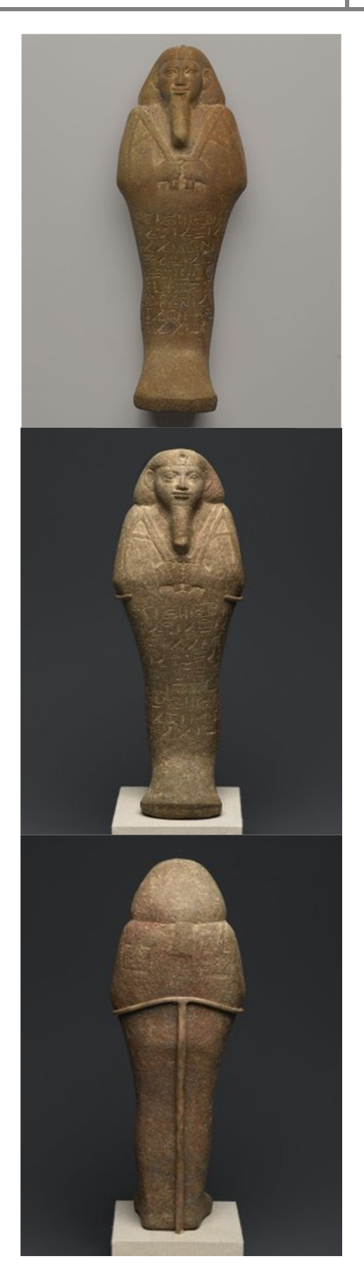
(Fig. 9) Shabti of Taharqa, Brooklyn Museum, Accession Number: 39.3