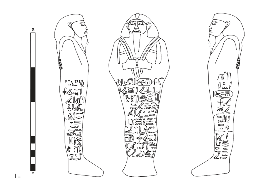
Pl. 1: Front and sides of shabti of Taharqa (Line Drawing by Mona Abady)