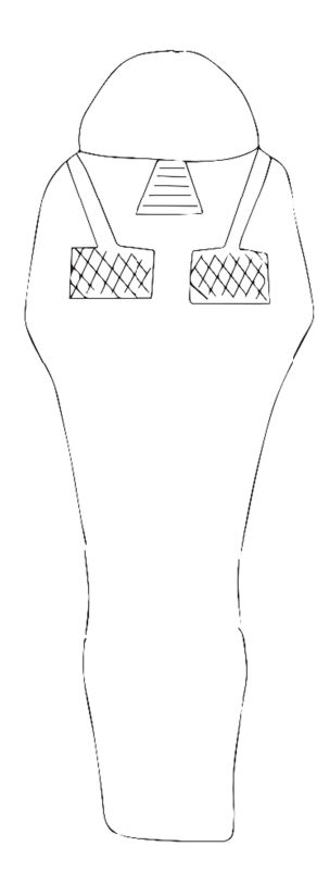
Pl. 2: Back side of the shabti (Line Drawing by Mona Abady)