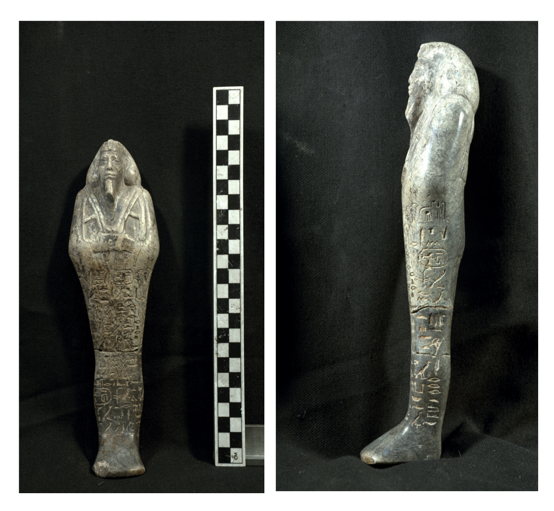
(Fig. 1) The Front Side (Fig. 2) The Left Side