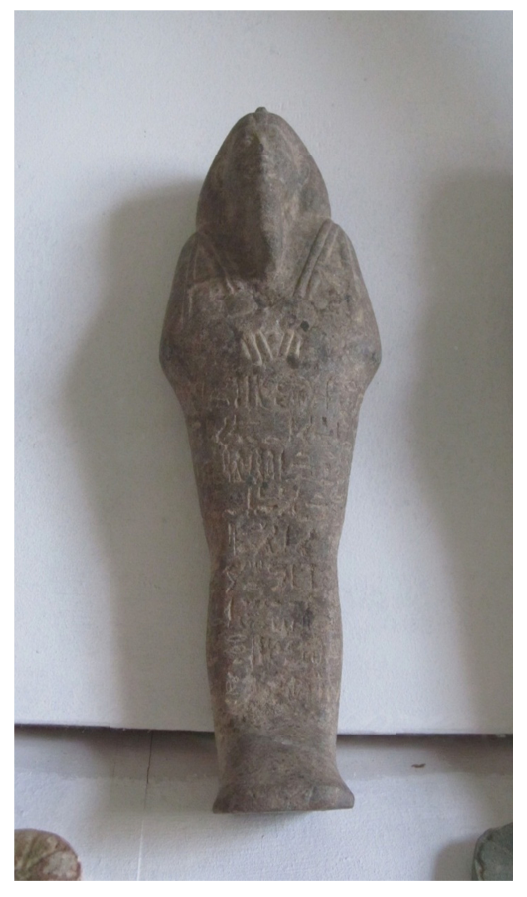
(Fig. 11) Shabti of Taharqa Egyptian Museum Accession Number: JE 46507