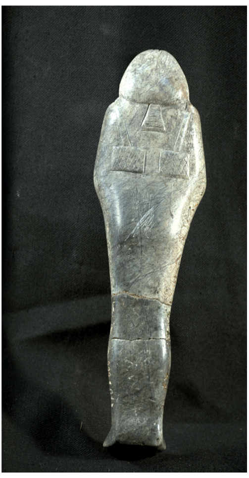
(Fig. 3) The Right Side (Fig. 4) The (Fig. 4) The Back Side