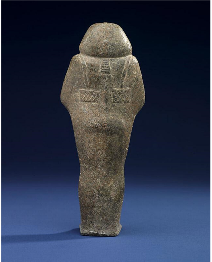
(Fig. 5) Shabti of Taharqa, Royal Ontario Museum, Accession number: 926.15.2