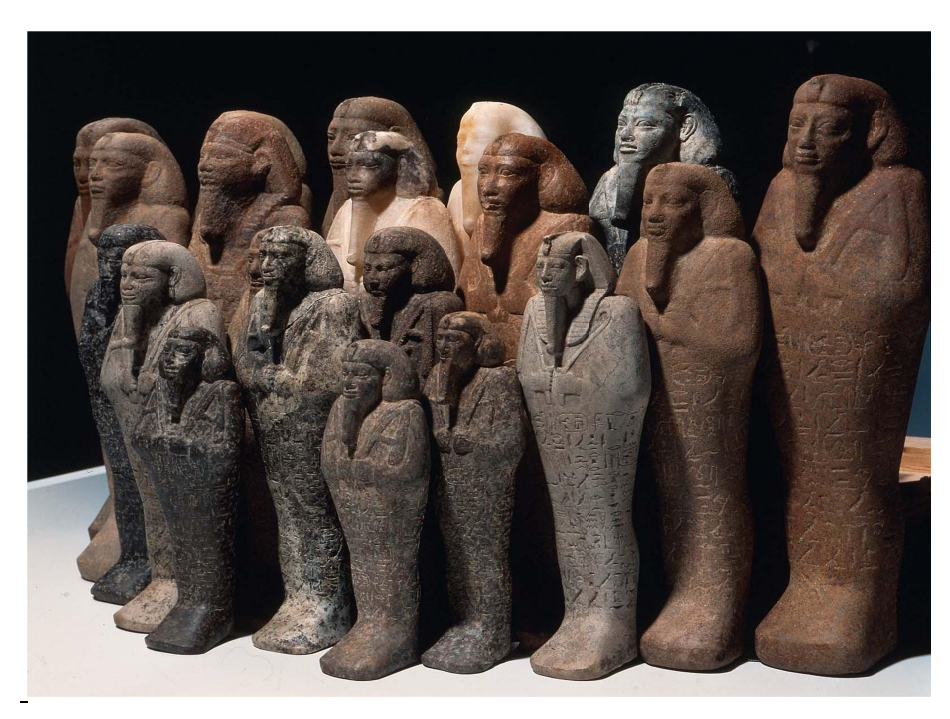
(Fig. 6) Shabti Collection of Taharqa, Boston Museum of Fine Arts, Accession Number: 20.225