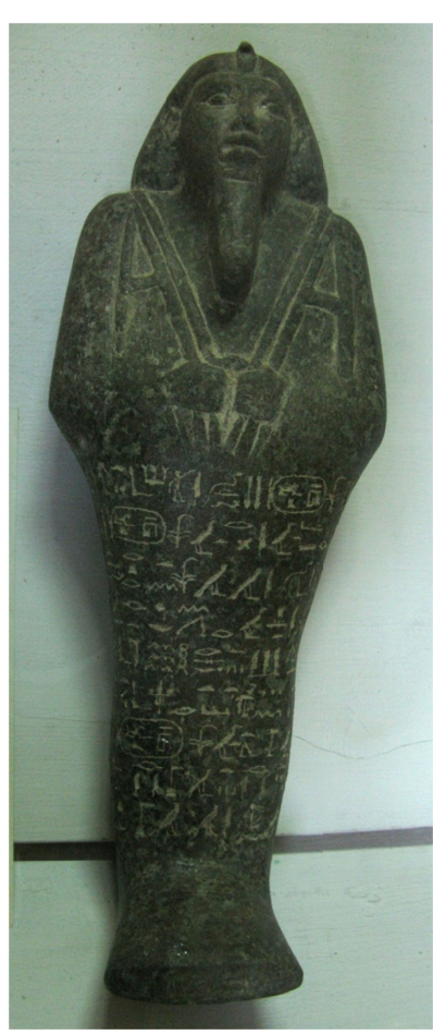
(Fig. 12) Shabti of Taharqa, Egyptian Museum,Accession Number JE 46508