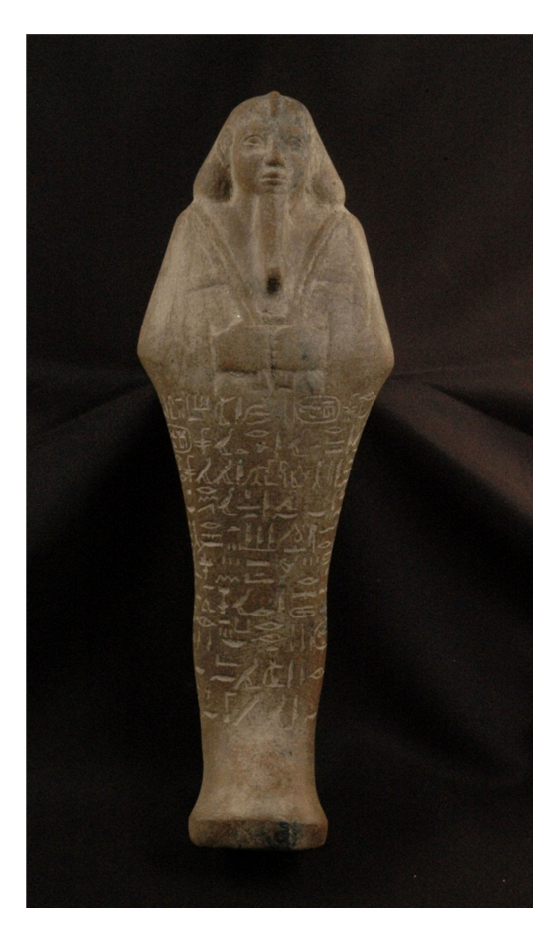
(Fig. 10) Shabti of Taharqa, Egyptian Museum, Accession Number: JE 46506