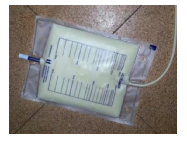
Figure 1. Tapped chylous ascites typical appearance.

After 2 weeks, his condition was controlled with a mild amount of ascites that did not need maintenance somatostatin thereafter. The other 3 boys received hospital IV and SC somatostatin, but ascites recurred massively in two which necessitated home biweekly SC doses of somatostatin that needed maintenance dose adjustment in only one child, while the other was off medications 4 months later without recurrence. Tables 1 and 2 demonstrate the clinical characteristics and outcomes of the 4 children.