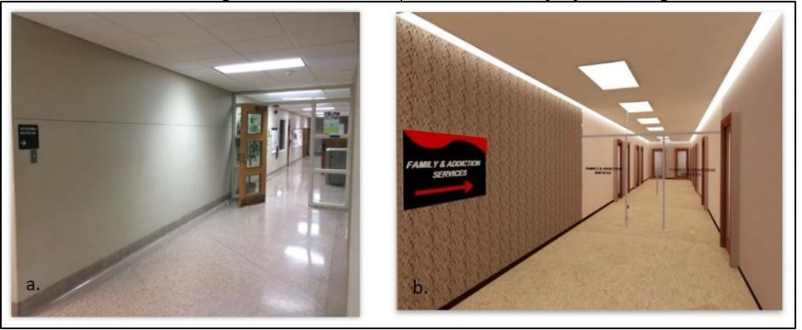
Figure 2: a). The current Family and Addisction Services department design. b). The proposed design of the department.

show the difference between the current place and the researcher proposed designs.