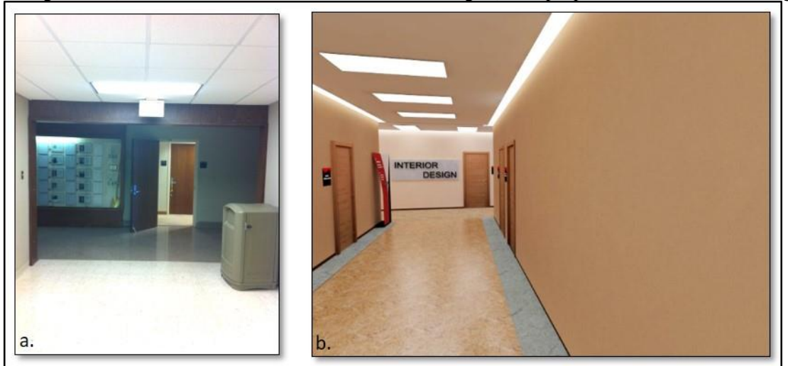
Figure 4: a) The current intersection of the Interior Design department. b) The proposed designed.