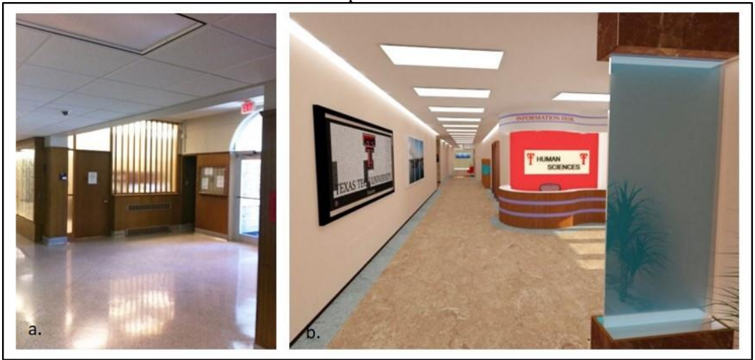
Figure 3: a) The current main entrance of the building. b) The proposed main entrance design.