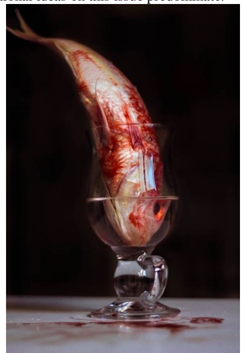
Figure 8, Fish And Glass Cup (Samaka wa-Ka's Zujaj), Fatima Al-Isa

Some families, even sometimes society, put many restrictions on women that almost prevent them from moving and bring down their morale, in particular when those limitations deny them their fundamental rights like the right to education, work, and marriage. Educating women, for some requires non-mixed girls-only a environment. Many families forbid their daughters from travelling abroad to continue their education or from work, as some husbands forbid their wives from working in mixed environments. All of this has denied some women opportunities to study or work even when they possess the requisite skills and talents, on the basis of a single reading of the religious text from a social perspective with a deep history shaped by traditions known as "custom." This denial under the weight of such restrictions has a direct effect on the mental and psychological state of women. Women who challenge the restrictions society imposes face many obstacles related to society's opinion or judgements on them, whether on their professional choices, way of dressing or maintaining modest dress, etc. They experience judgements whose consequences can be painful, as happened to those women who have chosen to work in mixed environments or studied medicine in spite of the difficulties imposed by work schedules and as a result sacrificed their prospects of marriage in a society in which traditional ideas on this issue predominate.