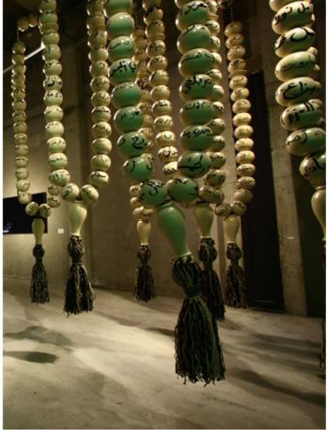
Figure 3: Esmi (My Name), 2012 - Manal Al Dowayan

In this work, My Name, seen in Figure 3, al-Dowayan asked hundreds of women to write their name on wooden beads, which she then gathered together in the shape of huge strings of prayer beads and attached to the ceiling. She organized several workshops for these women in Khobar, Riyadh and Jeddah. They included government employees, teachers, artists, mothers grandmothers as well as children's names written by their parents. This is how she broke the taboo forbidding men from saying the names of women openly, highlighting the unique position of Saudi society towards the names of women: Saudi men believe it is vulgar to mention the names of women in their lives and force women to hide their identities to avoid insulting members of the family. This custom exists only in Saudi Arabia, and has no basis in religion. Despite this work being controversial, it met with few negative responses, and participants had a positive experience because their names may now be remembered through the work. It was an experience that permitted them to produce a statement expressing their unanimous feeling: "Our names will be preserved, and we will not allow anyone to erase or change the names of Saudi women or to look at them as shameful or dishonourable." Identity is closely connected to an individual's personality.xxvii