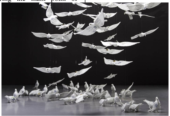
Figure 4: Suspended together (in 200 parts), fibreglass w/laminate coating, Manal al-Dowayan

Manal al-Dowayan produced a work titled Suspended Together (Figure 4) made up of 200 doves made from fibreglass. Every dove carries a travel permit which allow women to travel alone if they receive a signature from a man, because men are their legal guardians. The issue of the women's driving ban is currently under discussion in Saudi Arabia, and last year, Manal al-Shareef - who launched a campaign on the internet to convince Saudi women to resist the driving ban, stirring up much controversy – was arrested after uploading a video onto YouTube of her holding onto the steering wheel of a car. Viewing the work from afar gives an impression of freedom and movement, but when looked at more closely, the viewer sees that the doves are static, suspended, without the slightest hope of flying. These permits were donated by a huge number of journalists, scientists, artists and others representing Saudi society.xxxiii