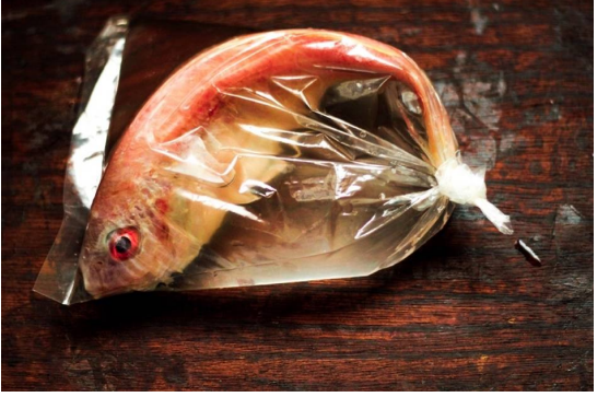
Figure 6, Fish And Plastic Bag (Samaka wa-Kis Blastik), Fatima Al-Isa

In the first piece (Figure 6), Fish And Plastic Bag, the fish has been removed from its original environment, the sea – based on the principle that people are born free in all societies, cultures and religions. But some cultures, including Middle Eastern culture, treat women differently, considering them to be different from men and believing that families must keep their daughters safe through a kind of isolation. Sometimes it is educational institutions which deny women their freedom by spreading the patriarchal culture of the society contrary to the background and culture that girls bring with them thanks to their upbringing. The same applies to the guardianship of women, which moves from their fathers or brothers to their husbands and thereafter may even pass on to one of their sons if their husband dies or divorces Many people oppose abandoning guardianship in order to keep women safe, without realizing that denying people their freedom, even if all of the ingredients of life are there, resembles denying a fish air even as it sits in the water: freedom and air are both invisible things, but still a matter of life or death. Removing women from normal life and putting them in a managed environment does not mean that they are able to live normally there: there are requirements for life beyond those which some see as fundamental and sufficient. The idea that the life of a woman is her family's house, her husband's house and then the grave is widespread in society.