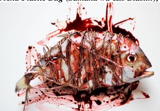
Figure 7, Fish And Metal Wire (Samaka wa-Silk Ma'dini), Fatima Al-Isa