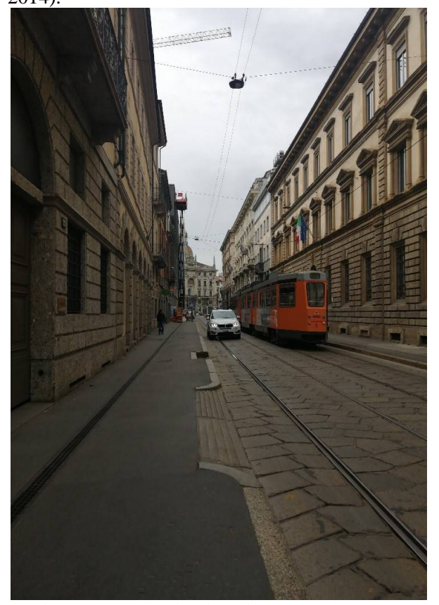
Fig2 Tram operating in Milan, (Author,2019) In the Indian state Kalkata, tram-rides are considered to be one of the significant experiences to figure out the city. The tour is being advertised through famous tours booking websites. Also, in Melbourne, Australia, there is a restaurant tram where passengers could eat and drink while having a tour. Another example is found in a port city in Western Australia in Fremantle, where hop on hop off tram is being operated, (Hop on hop off bus tours ,2019).

preferable mean of transportation as they are considered to be an environmentally friendly transportation system, where energy is highly consumed in-addition to its contribution to lessen traffic jams; noise; pollution and occupancy of physical space, (Zbigniew Konopacki-Maciuk, 2014).