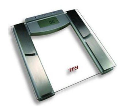
Fig. 1 Digital Glas-Diagnosewaage Model TGF-320H

It is a glass panel by sensors placed under the sole of the foot and has electronic screen, its inputs sex, age and height, then the laboratory should be stand on the glass and knock the soles of the feet above the sensors appears on the screen, percentage the bones, muscles, water and fat of the total weight, shown in (fig.1), This has been calibration this device with other similar devices to make