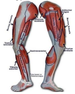
Fig (1) Legs Muscles

and estimation of mechanical power is disordered, furthermore, the validity of the simplifications is often disregarded<sup>7</sup>.