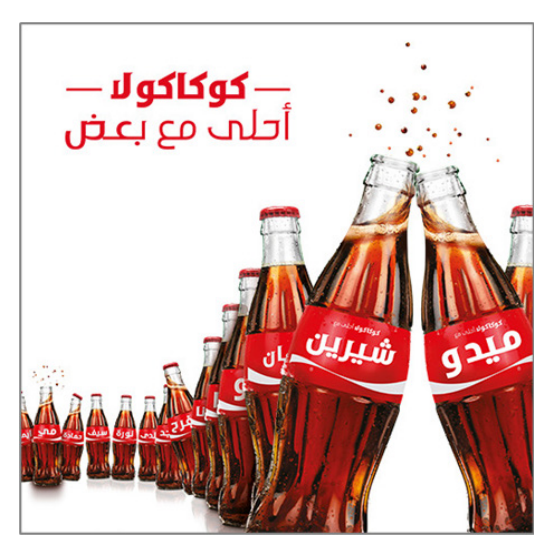
Fig. (2) a personalized advertising for Coca Cola, "Share A Coke" Egypt campaign 2014

Think Marketing (2017) described Coca Cola's campaign as a bold attempt crazy for good as usual. As people's names continued with an over 1000 names gaining strong social media following and engagement. On the other hand, a great success for Coca Cola's video which started as a touristic campaign and then grew bigger. As one of the greatest global brands and one of the most aged, Coca Cola's advertising team didn't hesitate to replace its logo with an Egyptian city name, with the well-known red color and white text, consumers have no problem in recognizing the brand. https://youtu.be/737NOuZx9TE