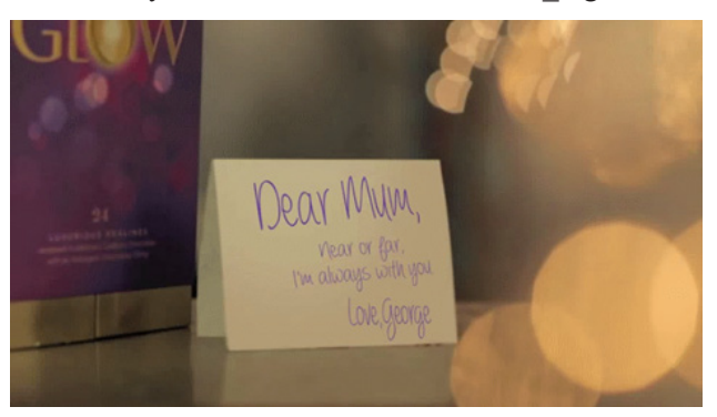
Fig. (4) a personalized advertising for Cadbury, Mother day, worldwide campaign

https://www.youtube.com/watch?time continue=49&v=yrxOOK-U4Uw&feature=emb logo