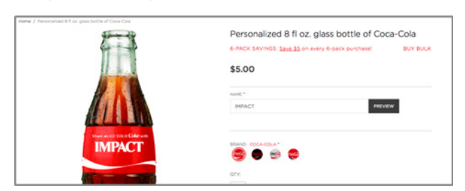
Fig. (1) a personalized advertising for Coca Cola, "Share A Coke" campaign, worldwide 2014

In 2014, Coke released "Share A Coke" campaign. The campaign aimed to reach out to teens and young adults, they launched bottles with 250 of the most common names of the generation. It then extended in terms of compliment, nicknames, relationships. In addition to the ability to customize a bottle. Now, there are over 800 names covering 77% of the U.S. aged 13-34. (Baum, 2017)