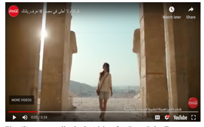
Fig. (3) a personalized advertising for Coca Cola, Egypt campaign 2017

Think Marketing (2017) described Coca Cola's campaign as a bold attempt crazy for good as usual. As people's names continued with an over 1000 names gaining strong social media following and engagement. On the other hand, a great success for Coca Cola's video which started as a touristic campaign and then grew bigger. As one of the greatest global brands and one of the most aged, Coca Cola's advertising team didn't hesitate to replace its logo with an Egyptian city name, with the well-known red color and white text, consumers have no problem in recognizing the brand. https://youtu.be/737NOuZx9TE