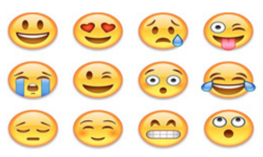
Fig (2) Emojis

The most popular Emoji's on APPLE & ANDROID platforms are: