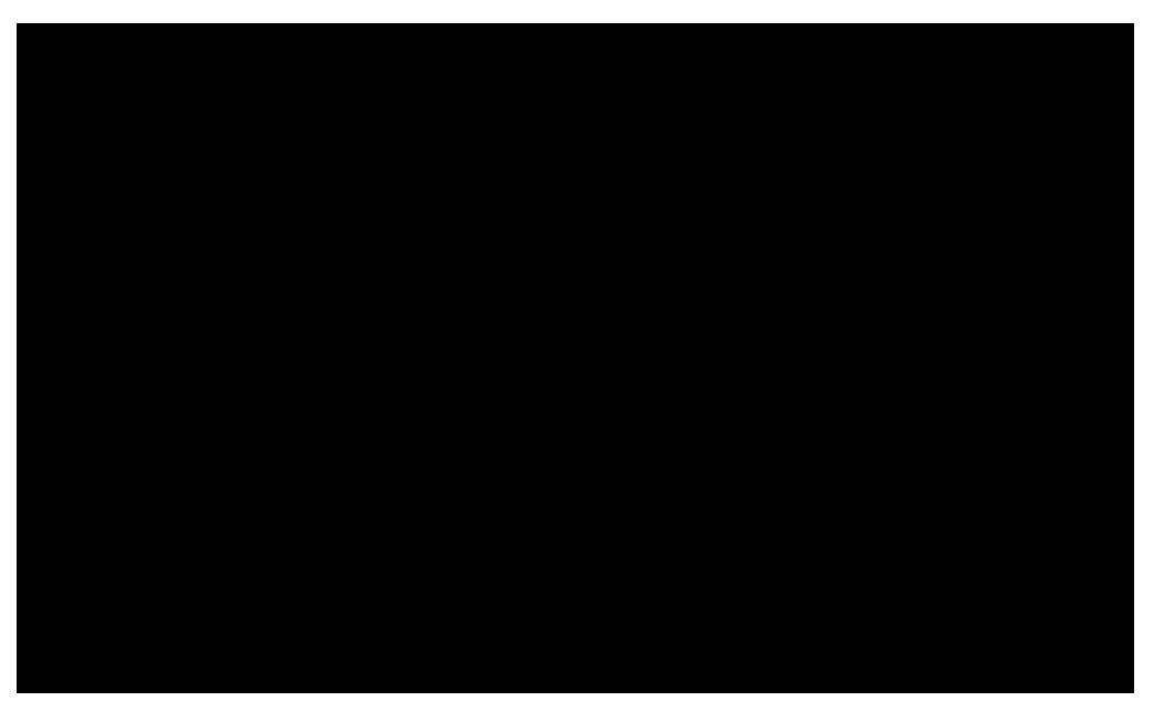
Figure (3): Mean levels of Serum lipid profile of studied diabetic patients according to TNF- \alpha results.