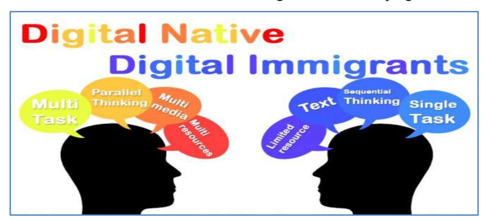
FIGURE (1) http://thesocialmediatrainee.wordpress.com/2010/05/09/digital-natives-vs-digital-immigrants/

the framework of the digital rise. The first mindset, called Mindset 1, assumes the digital revolution is just an extension of the industrial revolution. On the other hand, Mindset 2 assumes the world is now totally different from the way it was 30 years ago in terms of thinking and doing. Teachers with Mindset 1 believe there is no urgent need for a change of the educational model and they resist change. Teachers might think they do not need to change, as they succeeded without the digital tools. Change might be more difficult for teachers living or teaching where the digital development has just started to emerge, such as developing countries.