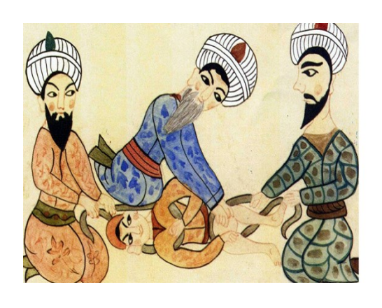
Medical treatment during the Ottoman Empire <a href="https://muslimheritage.com/attitudes-human-experimentation-ottoman-medic/">https://muslimheritage.com/attitudes-human-experimentation-ottoman-medic/</a>

before in Europe. This is another reminder that education has not developed in the same way or in parallel lines, simultaneously, everywhere in the world. It is also a reminder of the changing roles of various corners of the globe in the long story of human civilization.