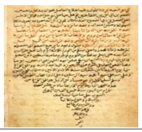
From a copy of Ibn Rushd's12<sup>th</sup> century commentary on the Poem on Medicine written by IbnSīnā. The copy was completed on the AH 1005, AD1597from a copy finished in AH633 AD1236.

Most of those educational initiations must have relied on manuscripts, rote learning and memorization till Egypt knew printing with the French campaign on Egypt and Syria (1798-1801), when printing had been known well