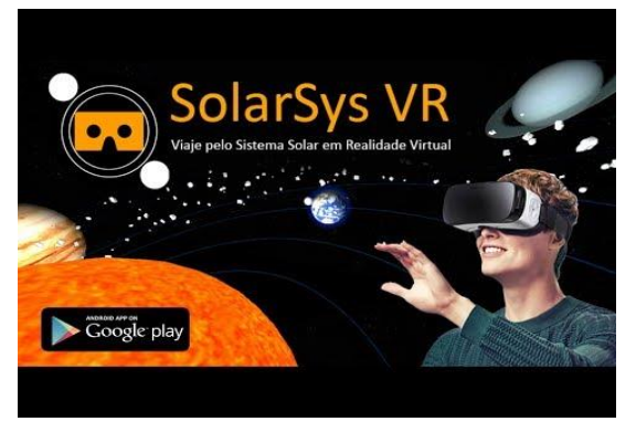
Figure (3) Solar Sys VR - Apps on Google Play

The researcher to develop the motivation of the kindergarten pupil developed some scientific concepts through the use of augmented reality by presenting a set of scientific concepts, which included (the solar colors) with Virtual system _ reality technology through some smart phone applications on (Google Play) (Solar Sys VR -Apps on Google Play), and the researcher designed a card to evaluate the student's performance in terms of range The student's understanding of the scientific concept from tow axes (the solar system - colors).