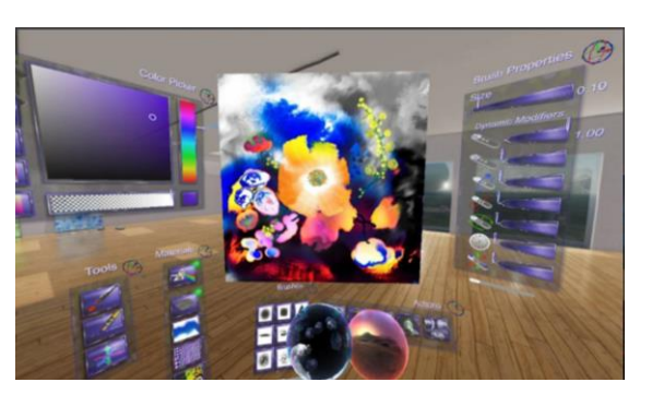
Figure (4) Cyber Paint - Apps on Google Play

The sample included (20) pupils from (2) kindergartens during the year (2019-2020), and they applied the research through (10) sessions at a rate of (2) per week , the researcher presented the concept to the student and explained it in a simple way.