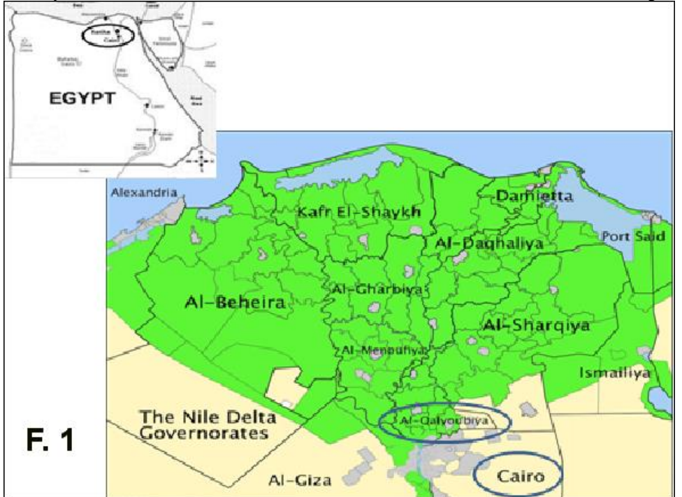
Fig. 1: Map of Egypt showing location of the study areas

versity Hospital (B): is the major hospital in Banha City. It consists of one building of eight floors with 1000 beds, 18 operation rooms and 18 ICU beds. The hospital is characterized by its low hygienic level due to the presence of an incinerator and garbage around it, and (4) Banha University Hospital Control Area (BC): Is the major vegetable market and surrounding premises located about 5 km from the hospital.