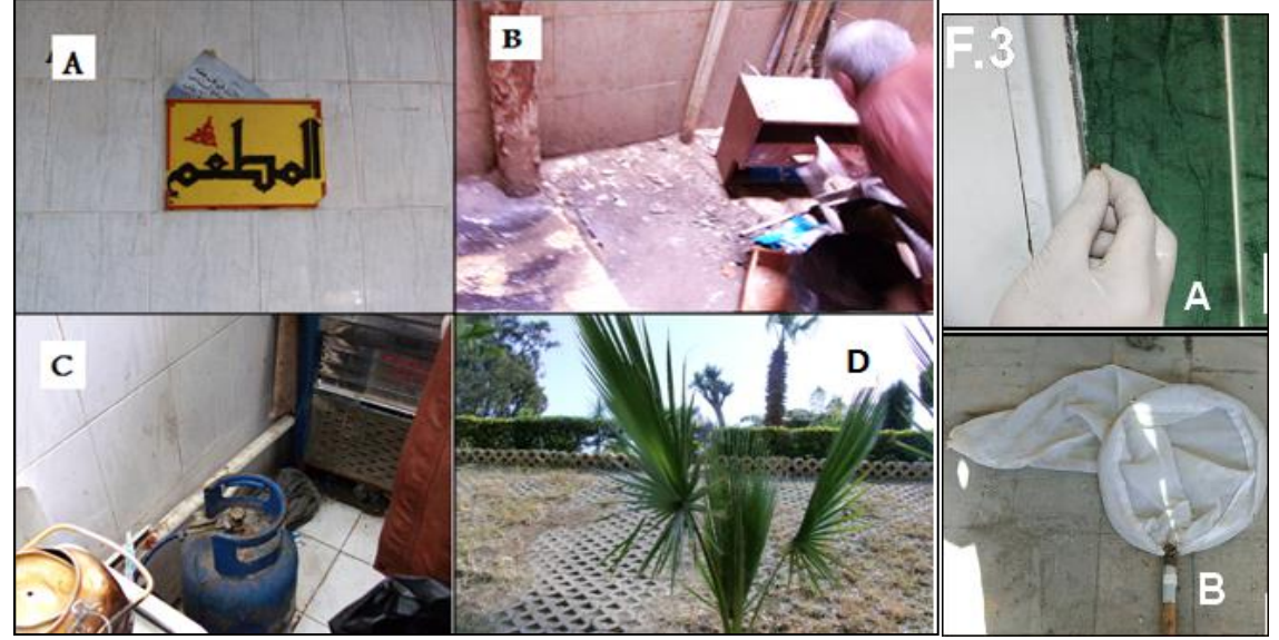
Fig. 2: Collection sites in Banha University Hospital: A. restaurant, B. basement floor and C. office in ophthalmology department and D a garden outside buildings of Ain Shams University Specialized Hospital Fig. 3: Collection methods of insects: A. Hand catches of crawling insects, B. Net collection for flies