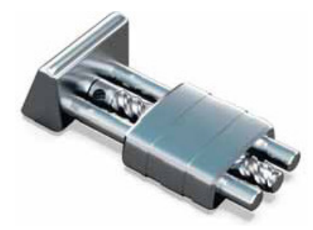
Figure 3: Bite jumping screw.