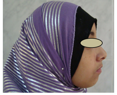
Pre & Posttreatment lateral view. Figure 4: Extraoral photographs.