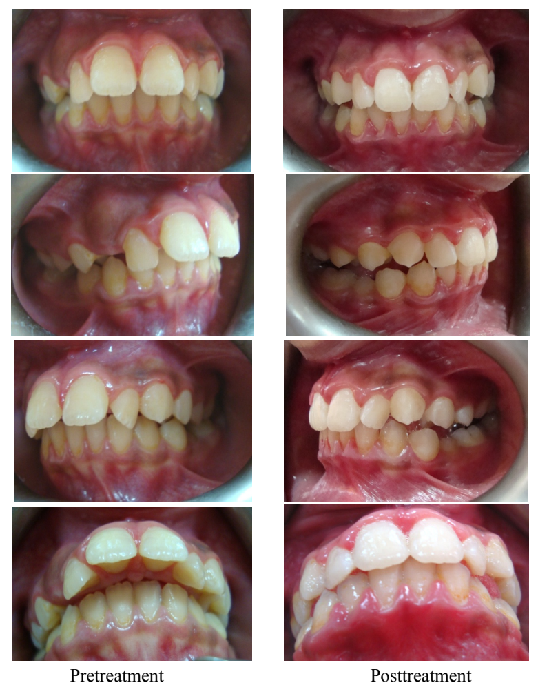
Figure 6: Intraoral photographs.