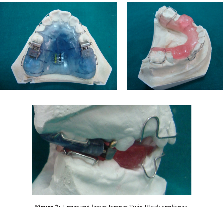
Figure 2: Upper and lower Jumper Twin Block appliance.

An expansion screw was seated in the midline of the acrylic base plate and activated only if necessary compensatory expansion was needed to accommodate lower arch as the mandible translates forward. The bite jumping screw was opened with a special stainless steel key to be active after eight weeks of twin block wear to give 2mm advancement of the bite. Then another 2 mm was obtained by activation of the screw after another eight weeks. If further correction was needed, there was still 2mm of advancement left in the system. An example of a case treated with this appliance is shown in (Figures 4, 5, 6, 7).