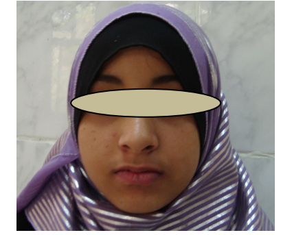
Pre & Posttreatment frontal view.