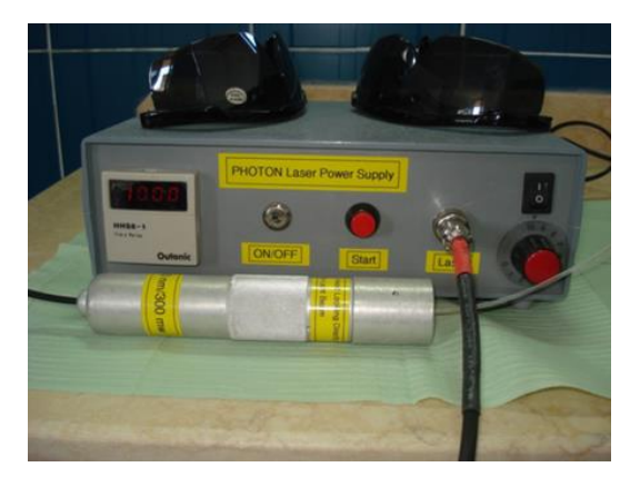
Figure 2: Laser apparatus used in study