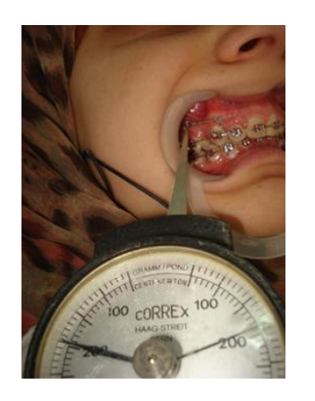
Figure 1: Force of retraction adjusted to 200 g per side

The LLT equipment used in this study was a Gallium Aluminum Arsenide (Ga-Al-As) semiconductor diode laser, continuous radiation of wavelength 810 nm and power output 20 mW. (Figure 2) The laser equipment was supplied by optic fiber with a tip of 2 mm in diameter and spectral area of 0.0314 cm2. Power density per point was 6.36 W/Cm2. LLL was applied by contact method on selected points to cover the buccal and palatal mucosa of the anterior teeth; Two points on the cervical third (one medial and one distal), two on the apical third (one medial and one distal) and one on the middle third (on the center) of each involved tooth both buccally and palatally.(Figure 3) Low level laser was applied for 10 seconds per point to deliver an energy dose of 0.2 J/point. Energy dose per session was 8 J/session. Energy density per point was 6.36 J/cm2. The application of low level laser was set at four times per month; following the onset of en-masse retraction; immediately after activation, 3 days after activation, 7 days after activation and 14 days after activation. The same protocol was repeated monthly till desired anterior retraction was achieved.