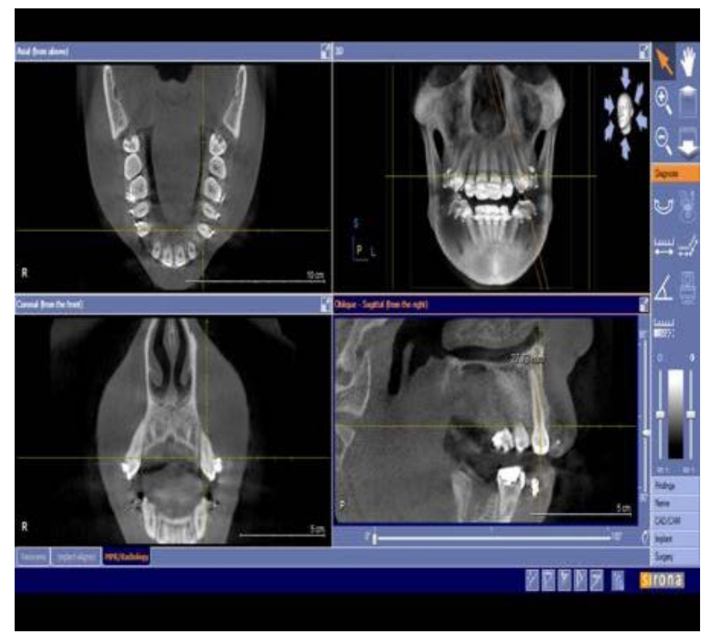
Fig 1,2: Root length measurement for the maxillary canines on both sides in both groups along the long axis in the sagittal view