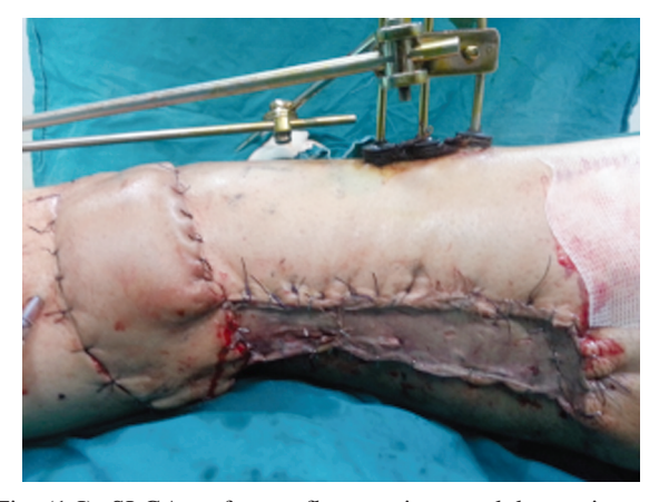
Fig. (1-I): SLGA perforator flap was inset and donor site was split skin-grafted.