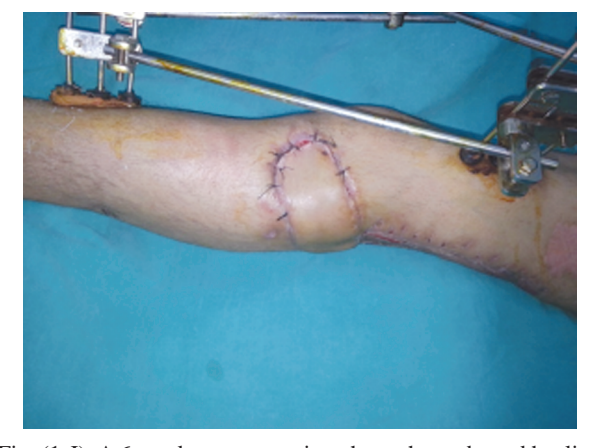
Fig. (1-J): A 6-week post-operative photo showed good healing of the flap, except small area at its most distal tip.

2A-E), the flap was used in a propeller fashion and had distal one-third necrosis, where the necrotic part was debrided and split-skin graft applied, Fig. (2-F,G).