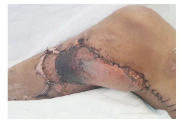
Fig. (2-F): Full thickness necrosis of distal third of the flap due to venous congestion. Debridement was done followed by skin grafting.