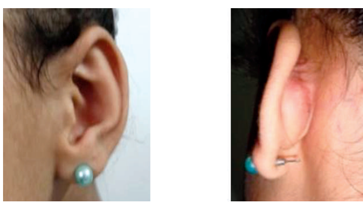
Fig. (6): The anterior and posterior aspects of the left ear, showing minimal morbidity in the form of postauricular linear scar.