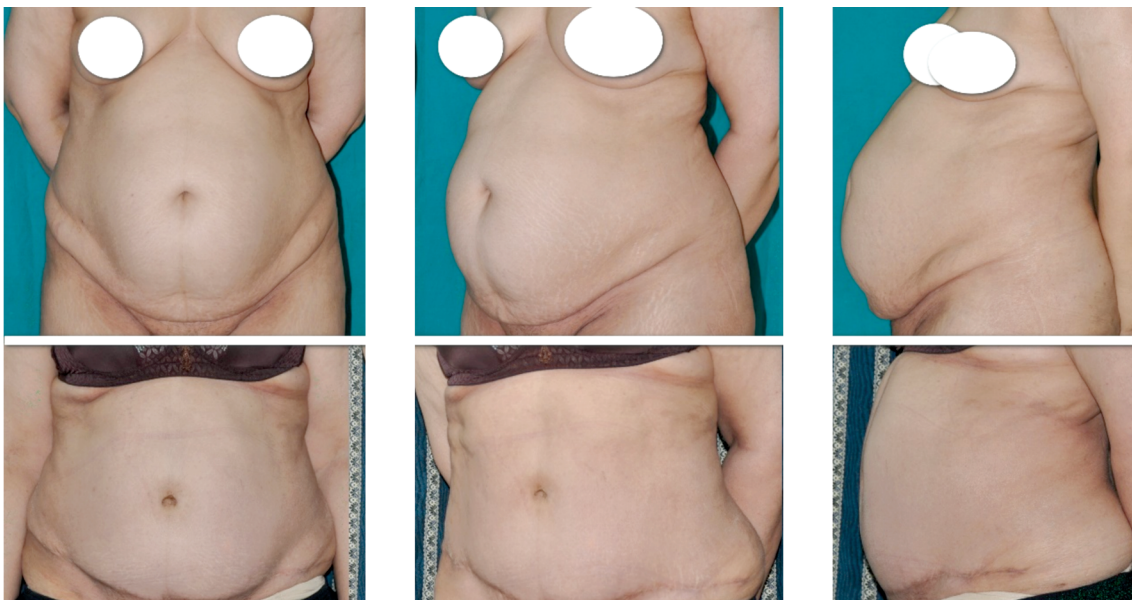
Fig. (3): Group (B) 45 y old patient, BMI 29.3. (Above) Pre-operative (Blow) 6 months post-operative abdominal contour.