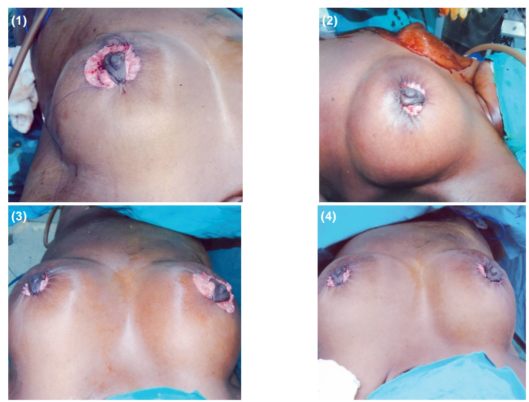
Fig. (2): Picture (1); Left breast with the first concentric intra dermal purse string, Picture (2); Same breast after second concentric row, Picture (3); Left breast after two concentric rows while Rt breast after one row with big difference in circumference between both areola, Picture (4); Breast bilaterally after two concentric rows.