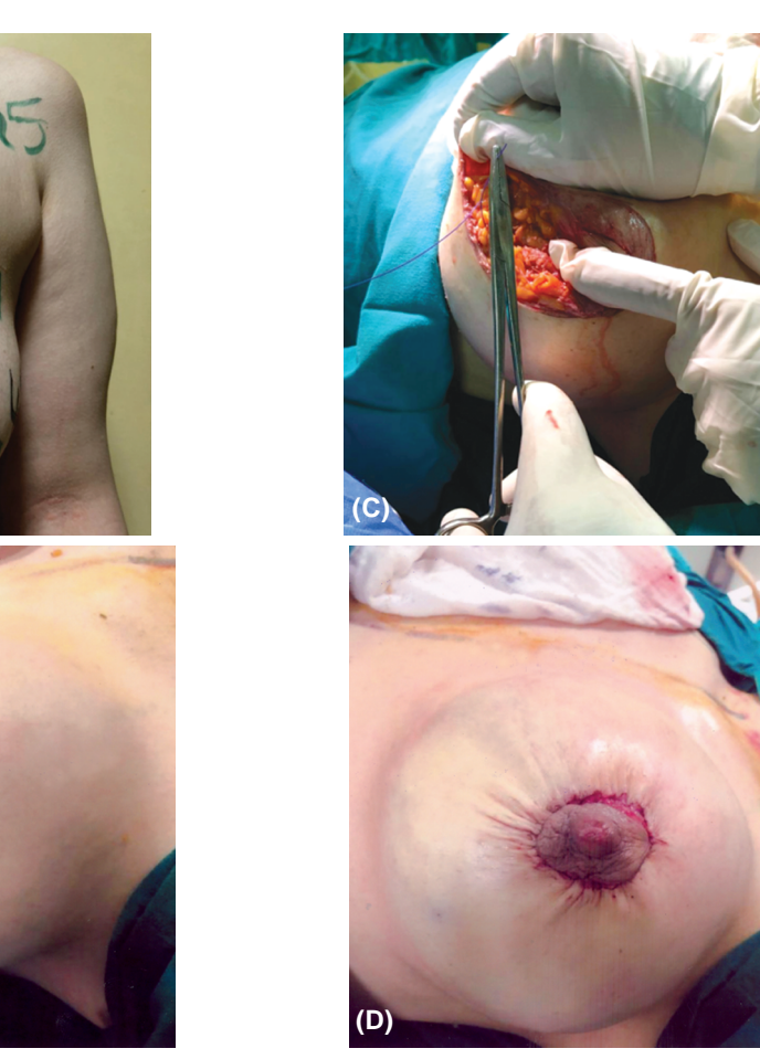
Fig. (1): (A-D): A: Surgical landmarks of peri-areolar augmentation mastopexy, B: Plication of bilateral pillars, C: First purse string while, D: After second purse string.