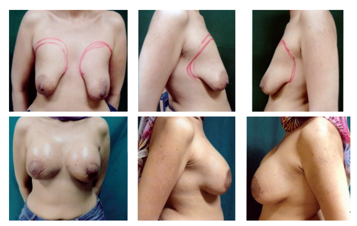
Fig. (4): Preoperative and postoperative views of 36 years patient.