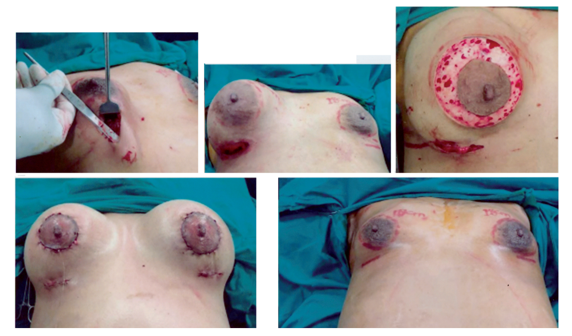
Fig. (2): (A) Inframammary incision, dissection of inframammary crease and scoring incisions of the constricting bands, (B) Isertion of mammary implant, (C&D) Reduction of areolar size and suturing, (E) Immediate pre & post operative result.