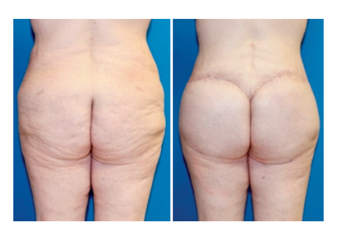
Fig. (2): Pre-and post-operative (after 6 months) for a patient in Group A.

Twenty-sex post-bariatric surgery female patients, age from (23-44 years) underwent belt lipectomy/abdominoplasty after massive weight loss; There was a decrease in the distance between the iliac crest and perceived superior gluteal margin, a decrease in the distance between the L5 dimple and the central crease, with lifting of the central crease, and a relative increase in the buttock projection compared with pre-operative distance in both groups Figs. (2,3). All measurements were taken and statistically analyzed. The p -value was calculated for both groups and was found that there is a highly significant statistical difference in the post-operative measurements in Group A.