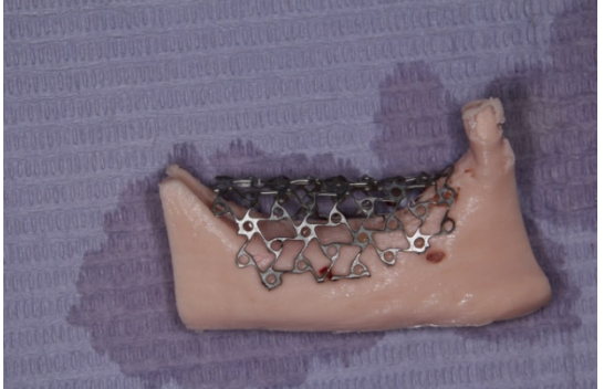
Figure (2): TiMe pre-adaptation using 3D model