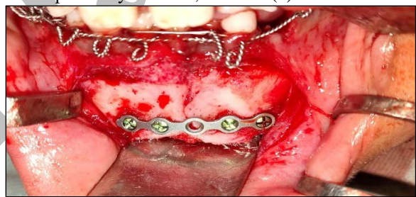
Figure (3): Fixation of titanium miniplate into its accurate positions.

These results attributed to excellent PEEK biocompatibility because of its bio-inert and hydrophobic characteristics and adequate mechanical properties. In agreement with the results reported by Lv et al., in 2022. (3)