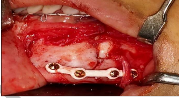
Figure (2): Fixation of custom-made peek plate into its accurate positions.

The mean operative time was significantly less in the study group than that of the control group. In the study group the overall postoperative complications were less than in the control group but the difference was insignificant. After three months, postoperative CTs scans revealed proper bony union in all directions and the mean bone density was statistically higher within the study group than the control group.