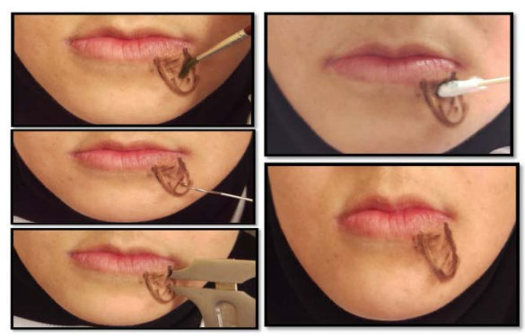
Fig (5): Clinical Neurosensory testing