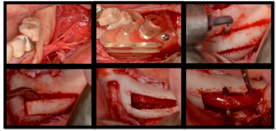
Fig (2) Surgical technique