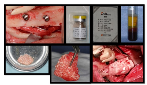
Fig (4) Procedures done for group II